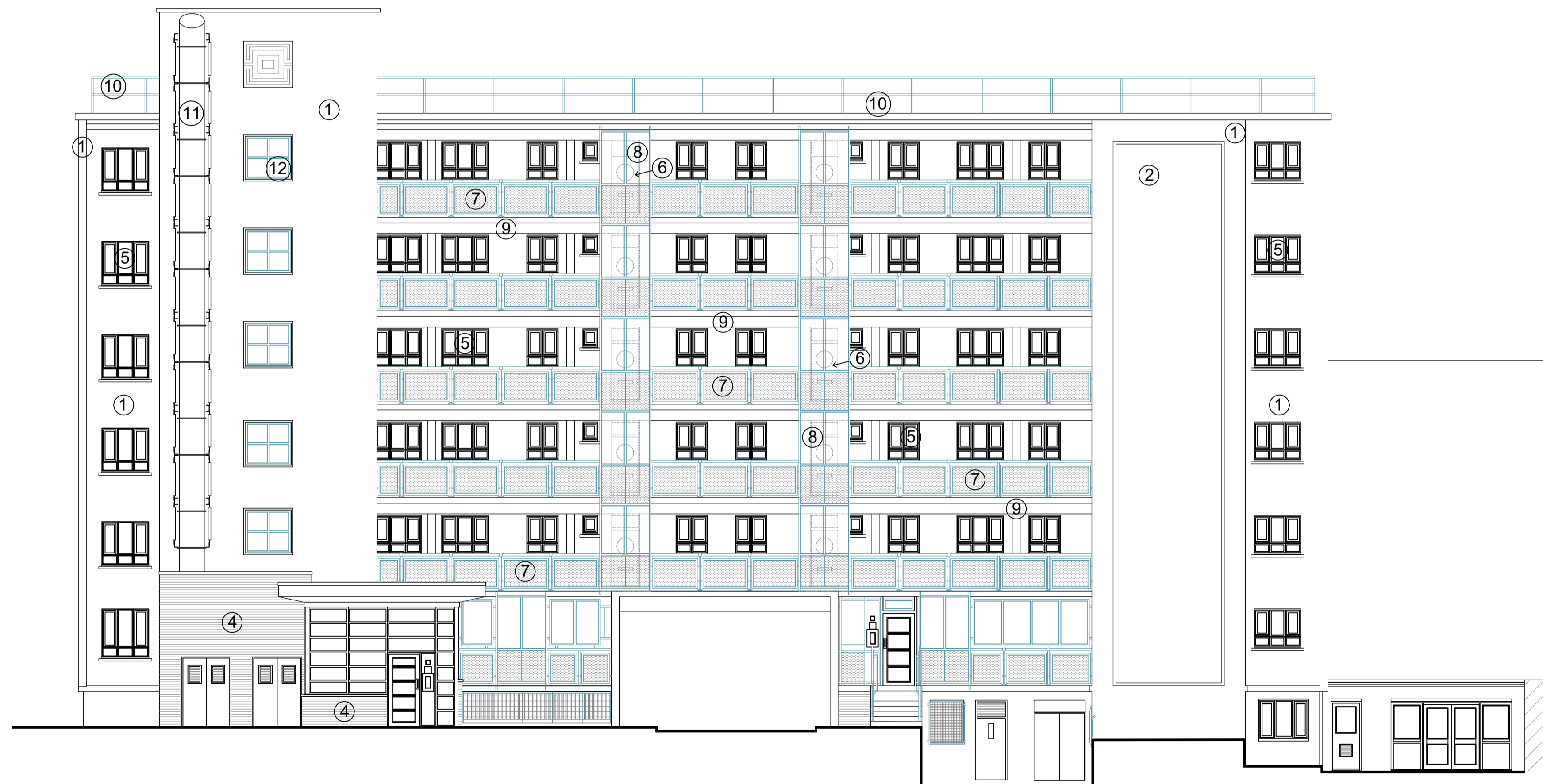
Fleetfield - Elevation A (North West)