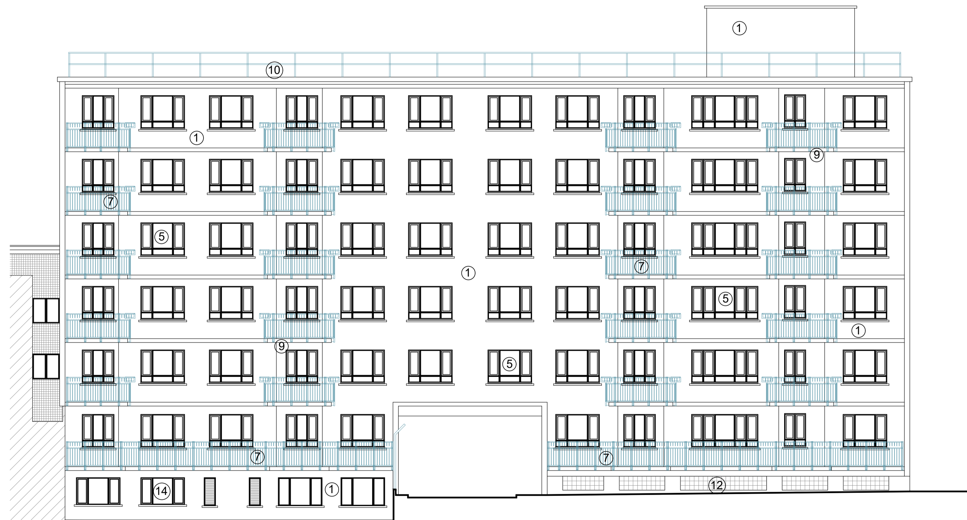
Fleetfield - Elevation B (South East)