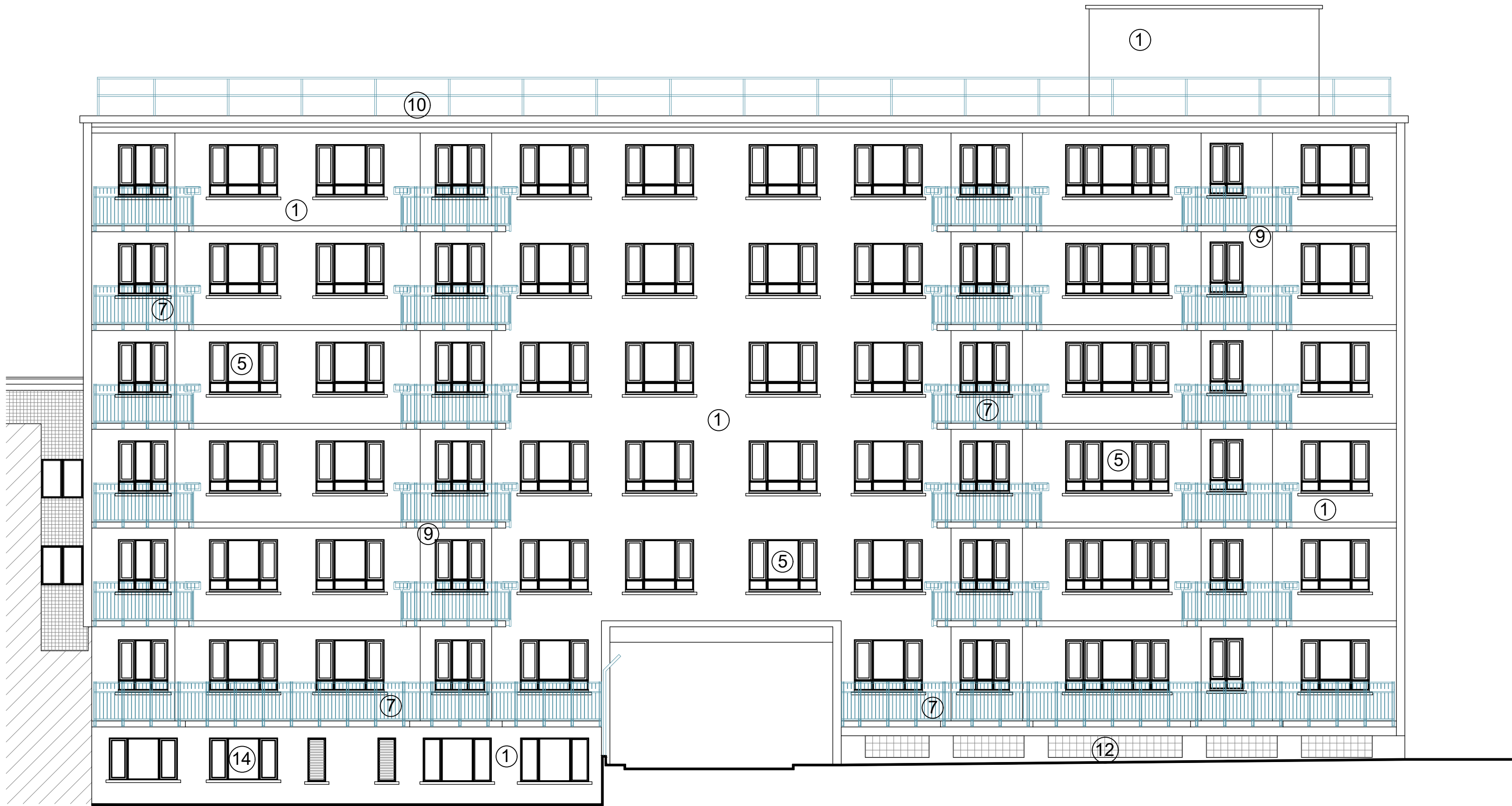
Fleetfield - Elevation B (South East)

NOTE: ALL COLOURS SHOWN ARE ESTIMATES ONLY AND MUST BE CONFIRMED ON SITE