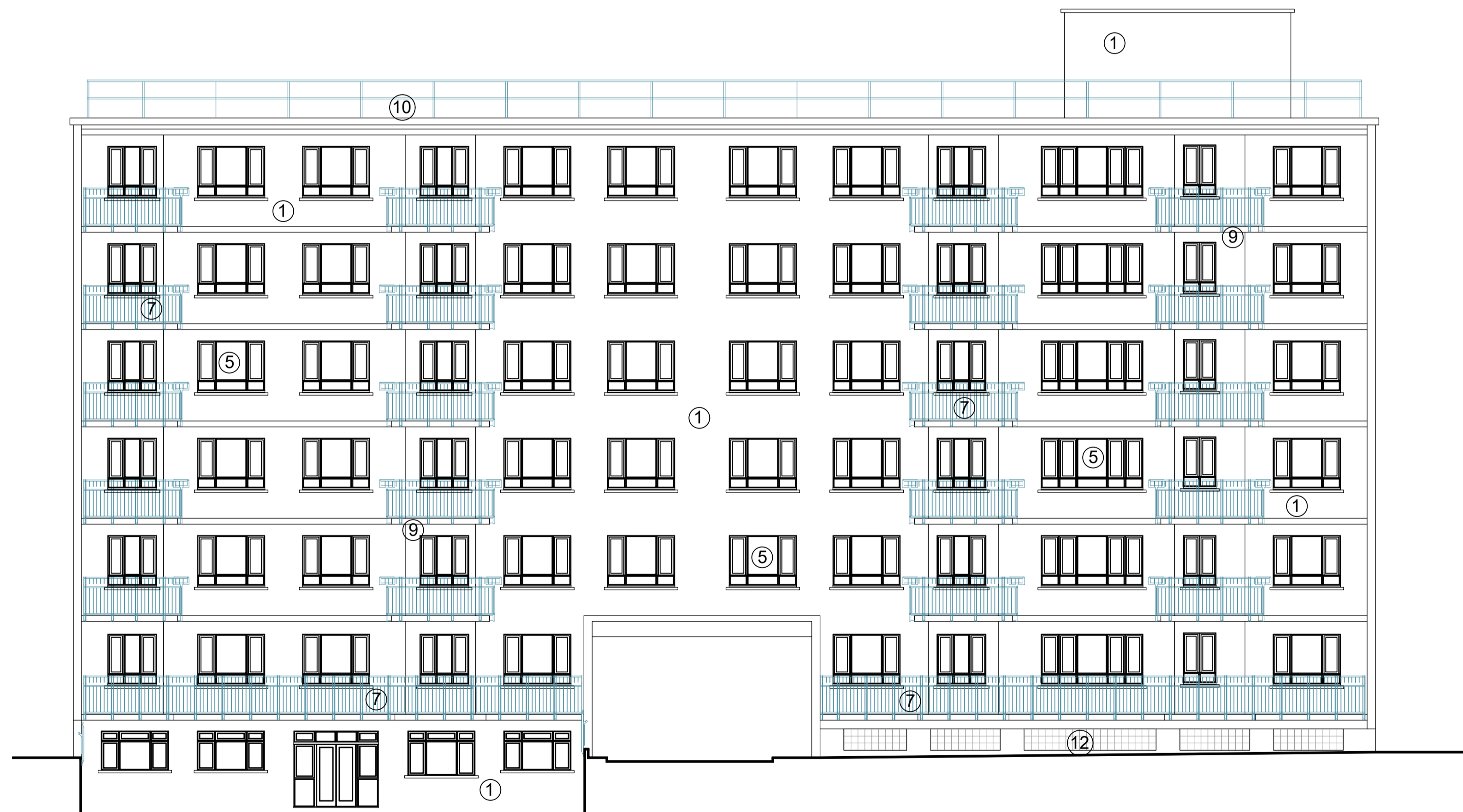
Fleetway - Elevation B (South East)