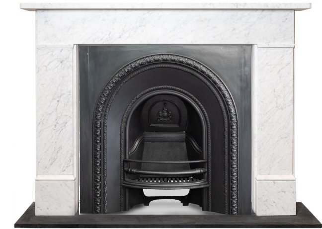
I Image Not to scale

© This drawing is the property of Miltiadou Cook Mitzman architects. No disclosure or copy of it may be made without the written permission of Miltiadou Cook Mitzman architects. For construction purposes: - Do not scale this drawing. - All dimensions and levels to be checked on site. - Discrepancies to be reported to Miltiadou Cook Mitzman architects before proceeding. - If in any doubt about information on this drawing contact Miltiadou Cook Mitzman architects.