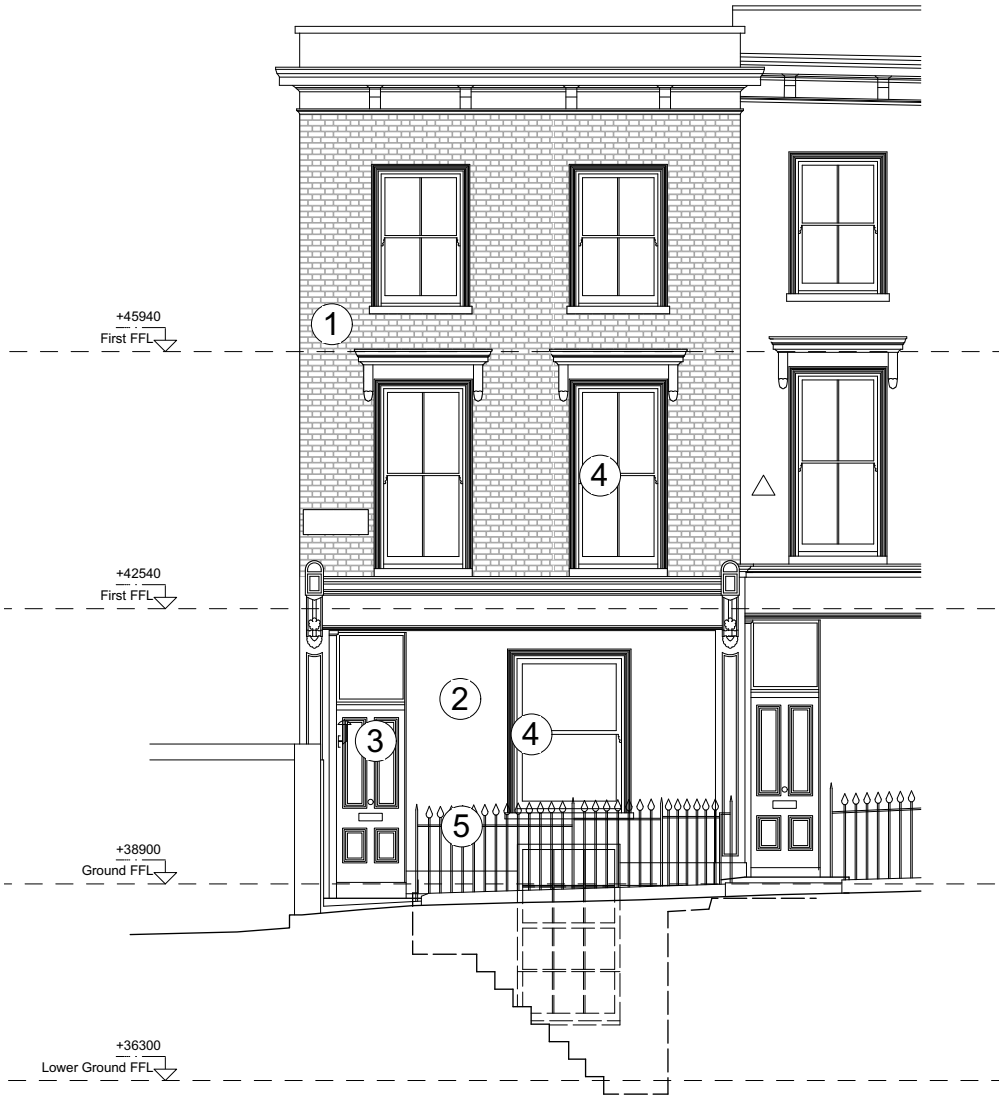
1 Front Elevation-Existing 1:100

GENERAL MAINTENANCE WORKS: -REPOINTING OF BRICKWORK WHERE NEEDED TO MATCH THE EXISTING -REPAINTING OF STUCOO TO MATCH THE EXISTING -REPAINTING OF WINDOW FRAMES TO MATCH THE EXISTING -REPAINTING OF ENTRANCE DOOR TO MATCH THE EXISTING