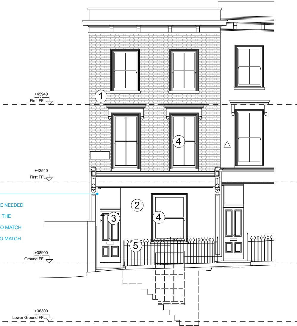
2 Front Elevation-Existing 1:100

GENERAL MAINTENANCE WORKS: -REPOINTING OF BRICKWORK WHERE NEEDED TO MATCH THE EXISTING -REPAINTING OF STUCOO TO MATCH THE EXISTING -REPAINTING OF WINDOW FRAMES TO MATCH THE EXISTING -REPAINTING OF ENTRANCE DOOR TO MATCH THE EXISTING