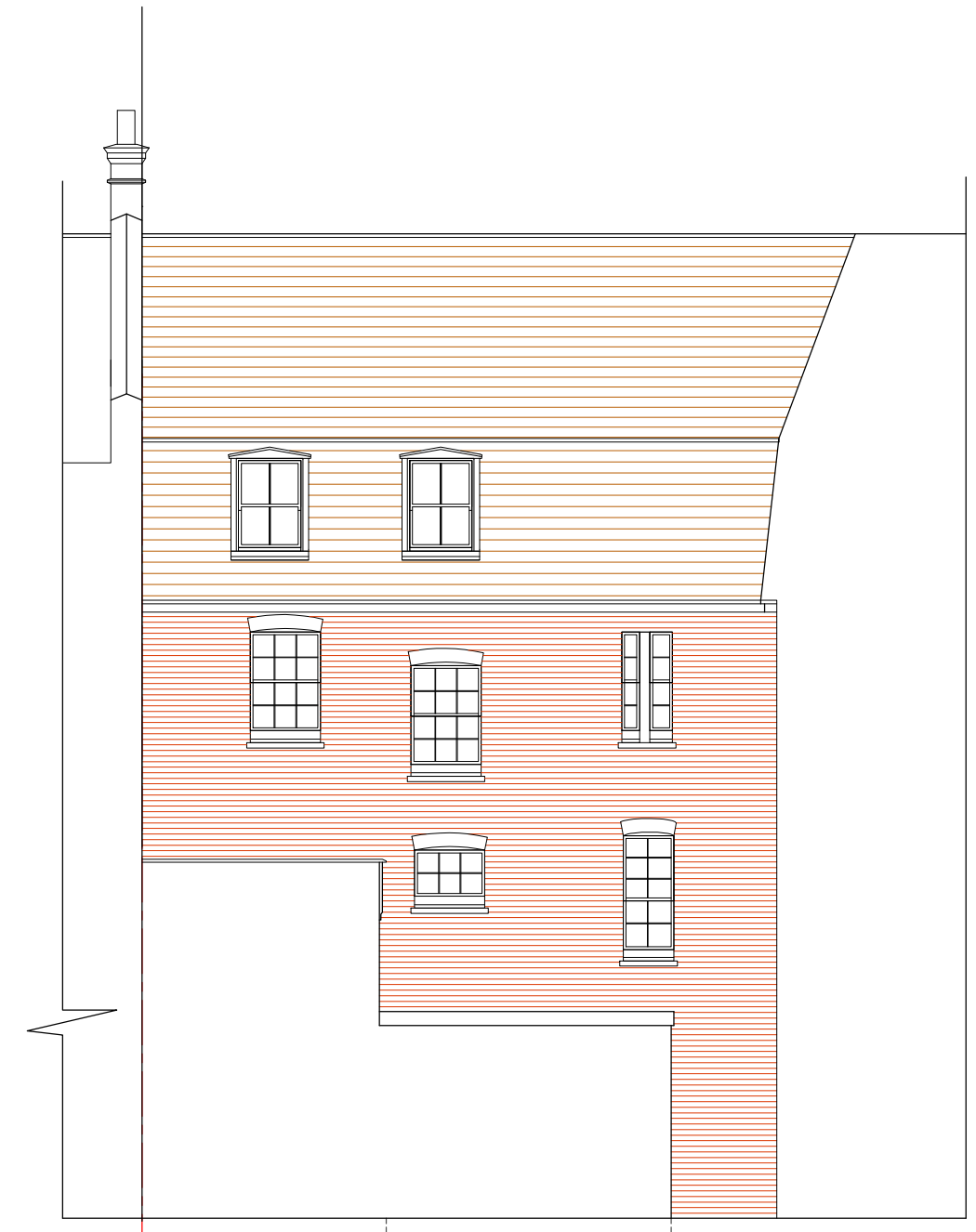
SOUTH WEST ELEVATION THROUGH LIGHT WELL