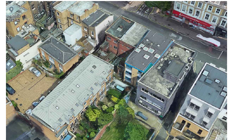
2.4 - Aerial view (South / West)