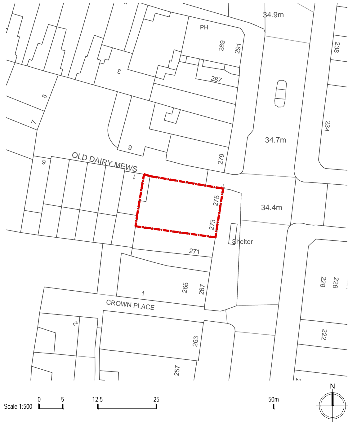
[01] BLOCK PLAN 1:500