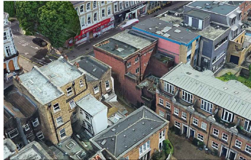
2.1 - Aerial view (North / West)