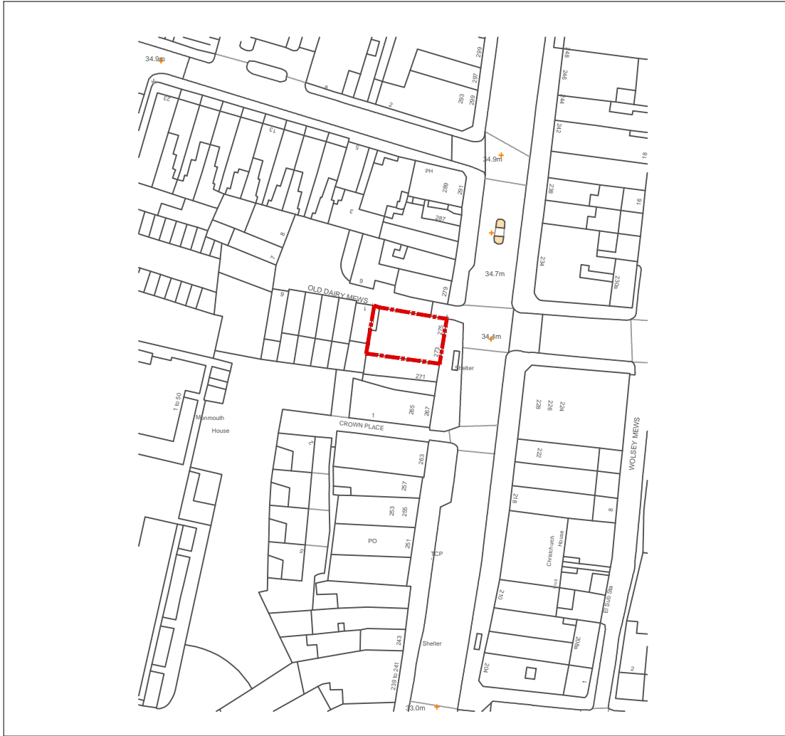
[01] OS MAP SITE PLAN 1:1250