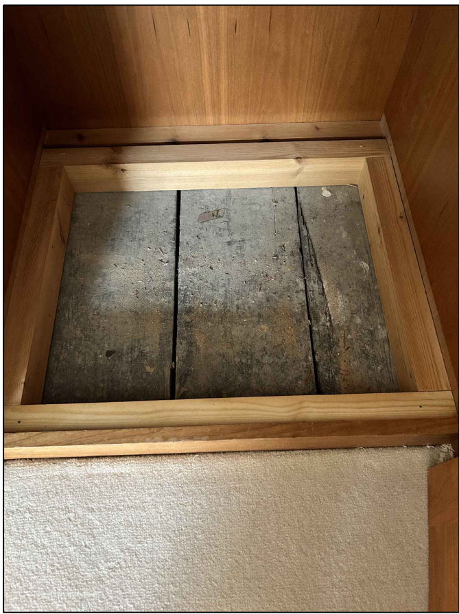
Opening Up Photo

Red circle indicates location of opening up.