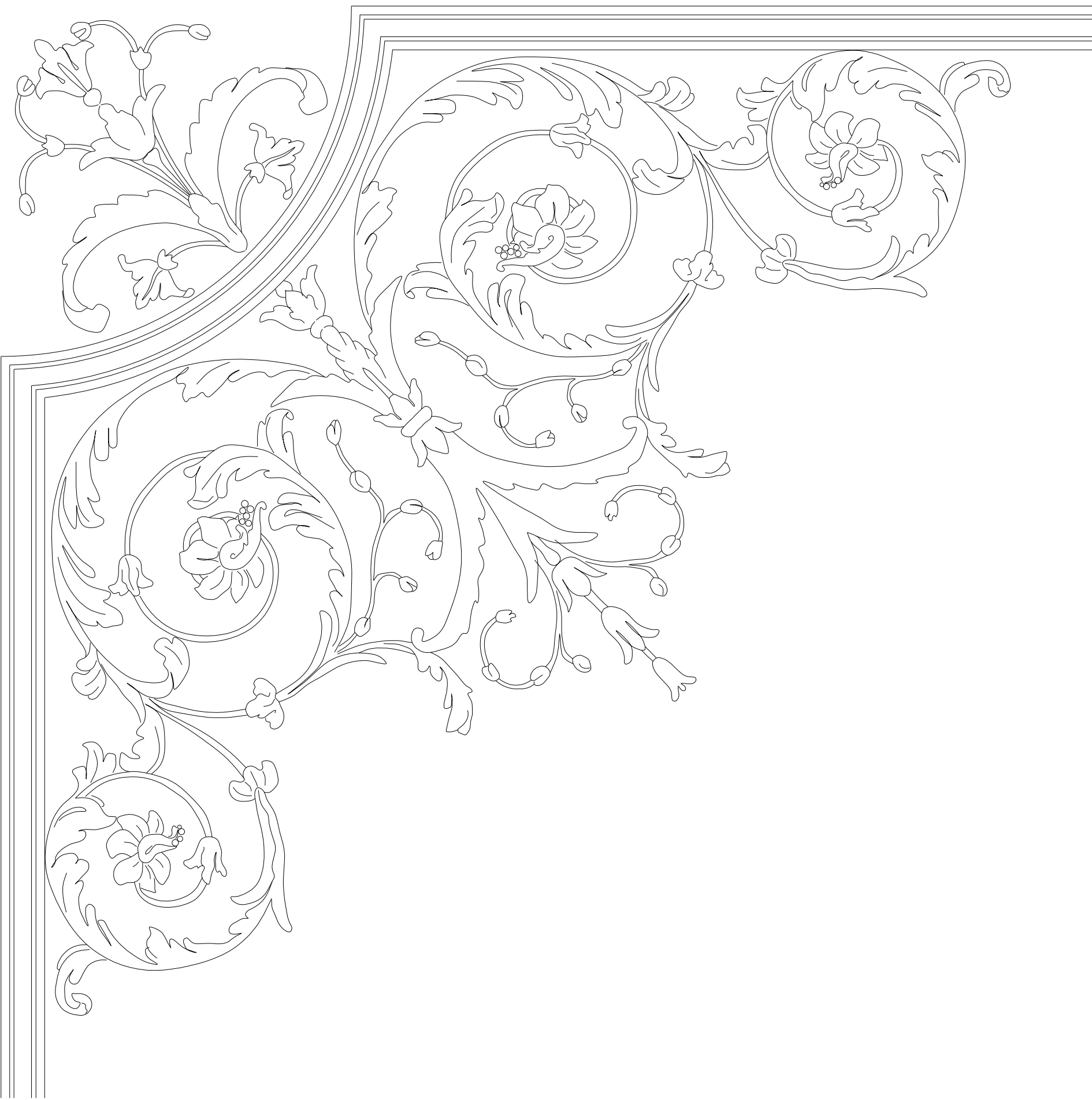
Ceiling Rose Type H.1 Supplier: Stevensons of Norwich Name: English Floral Ceiling Corner Moulding Supplier Reference: DC29 Material: Plaster