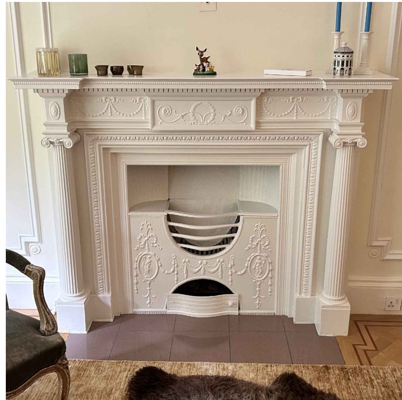
Existing Drawing Room Fireplace Images