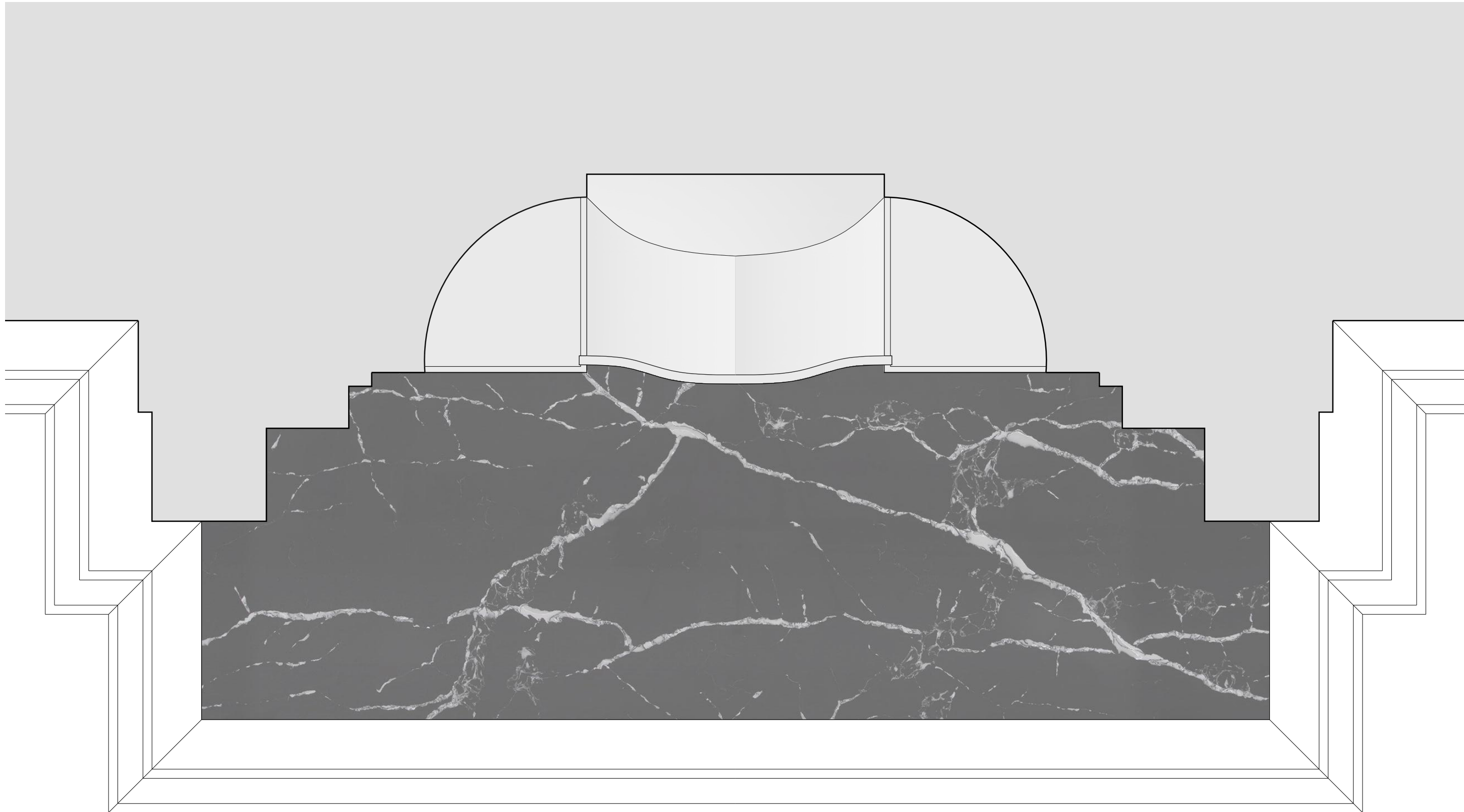
Fireplace Plan 1:5