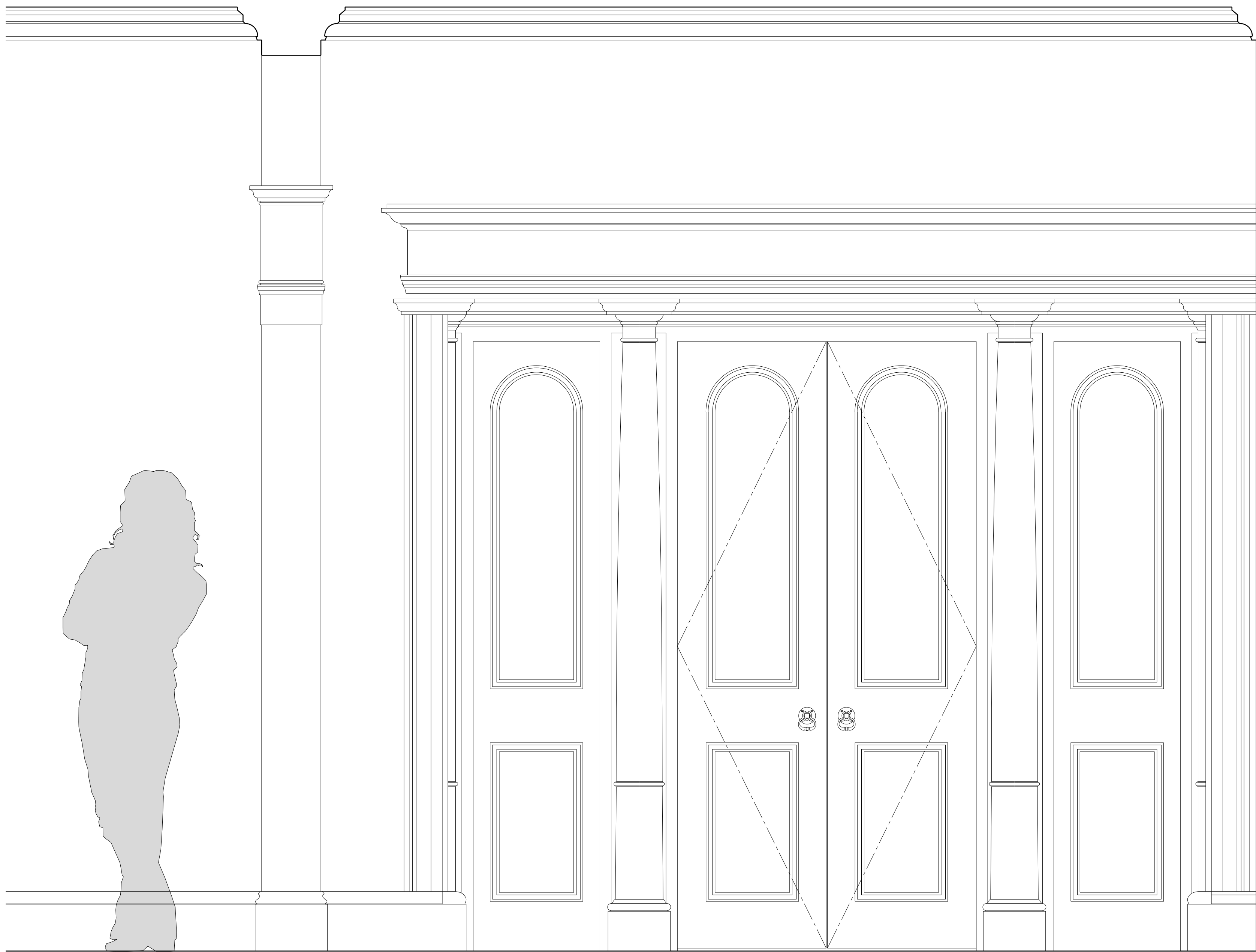
Existing Entrance Hall (RG02) East Internal Elevation 1:10

Note Existing doors and fixed side panels are thought to be modern based on condition when reviewed on site, this is evidenced by the fact they are not shown on the historic floor plans dated 1974. Columns and jamb mouldings are thought to be older, but are likely to not be original.