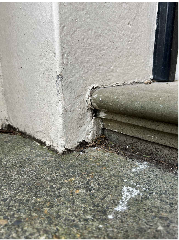
Existing Front Door Threshold

© SIMON MORRAY-JONES. ALL DIMENSIONS TO BE CHECKED ON SITE BEFORE WORK COMMENCES. ANY DISCREPANCIES TO BE REPORTED TO THE ARCHITECT. DO NOT SCALE