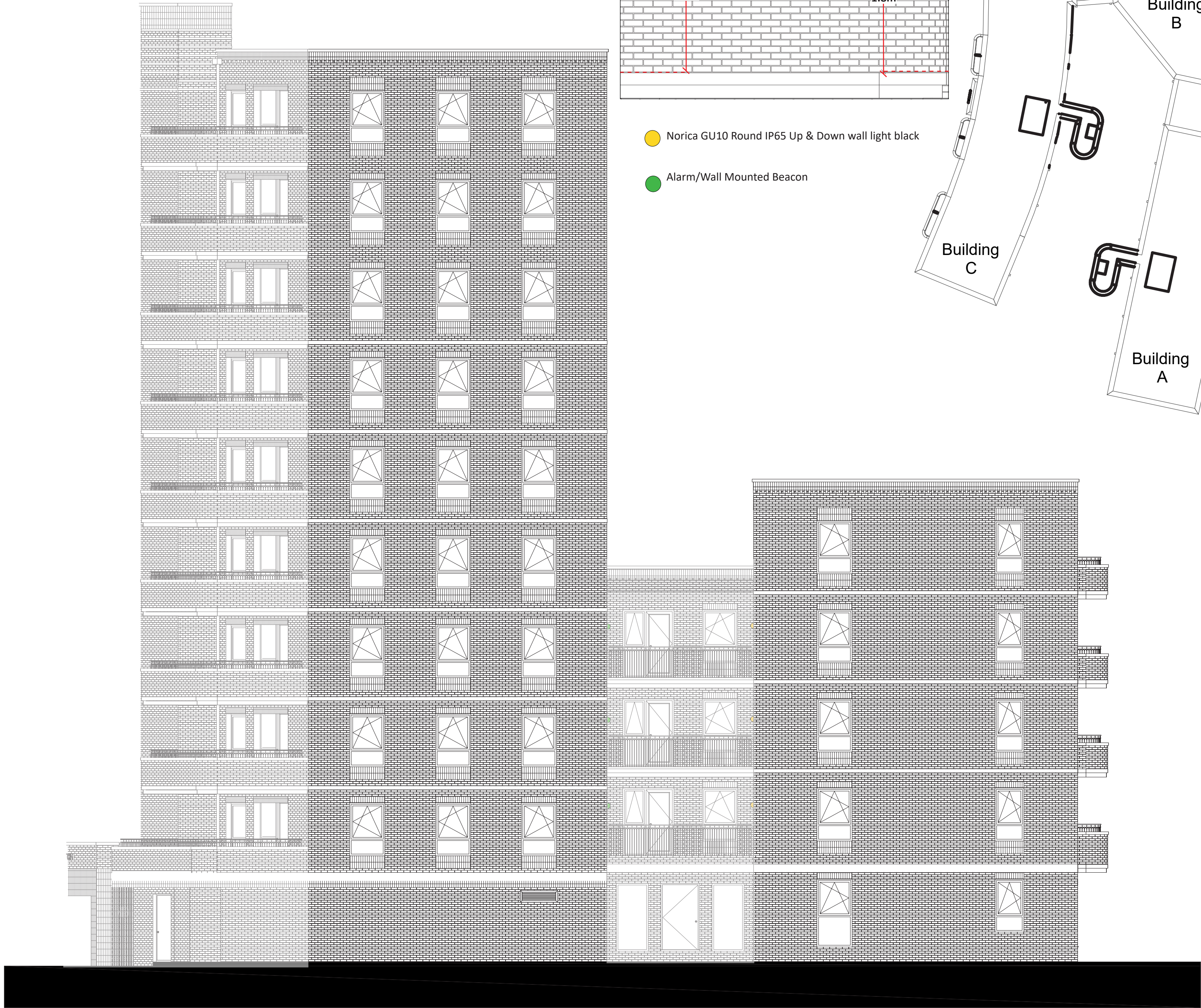
Key - Setting Out