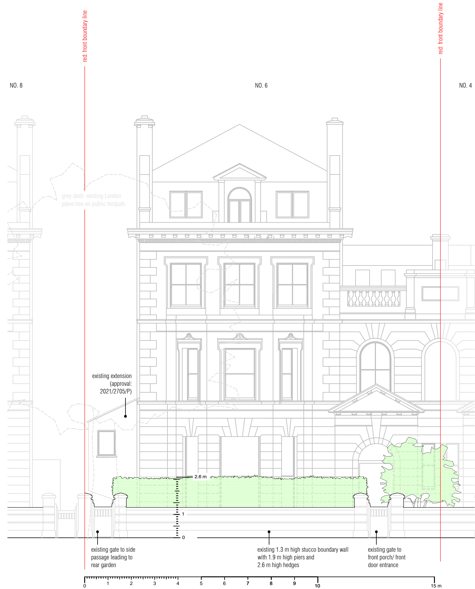
FRONT ELEVATION - AS EXISTING (1:100)