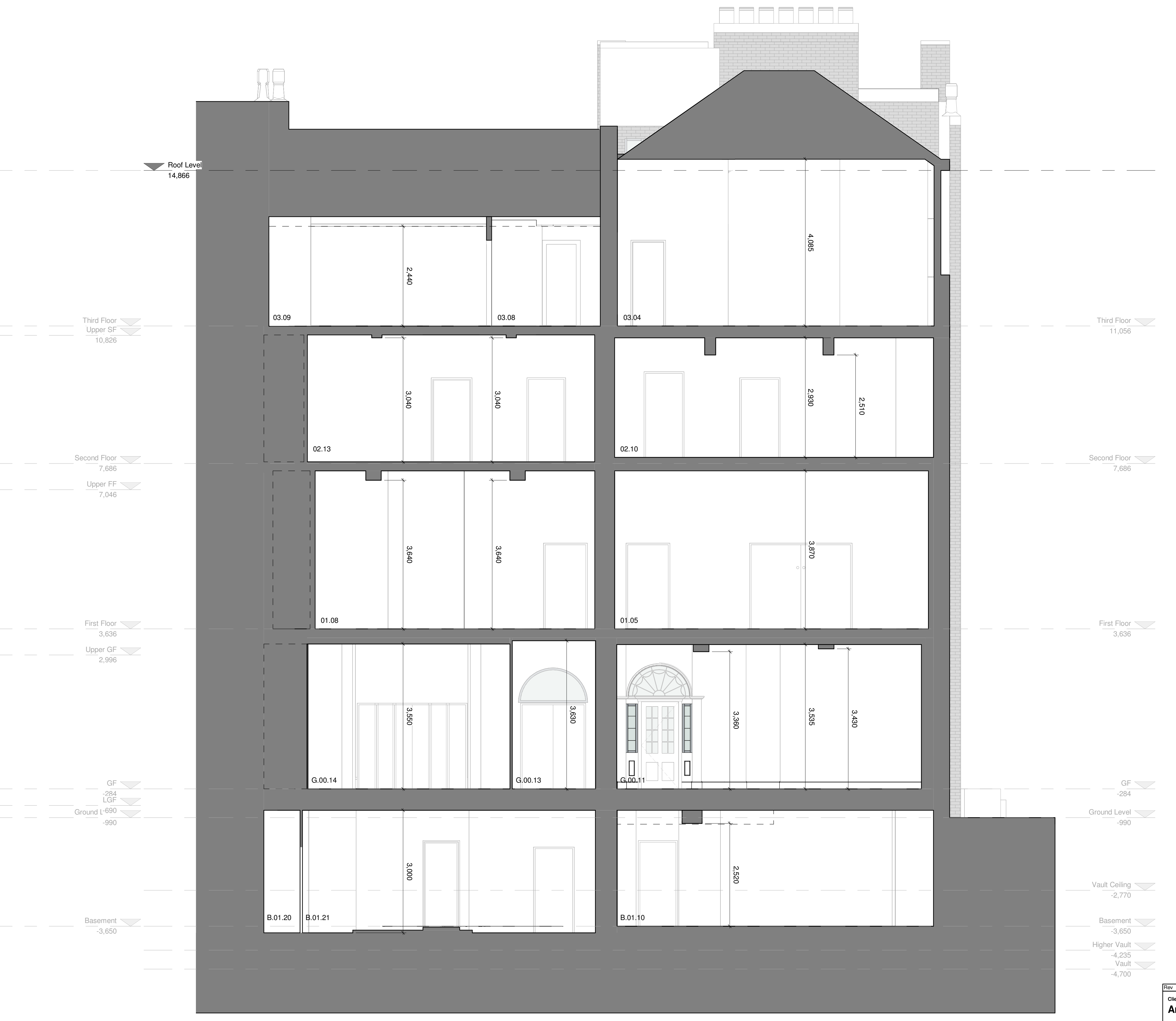
Existing Section D - D 1 : 50