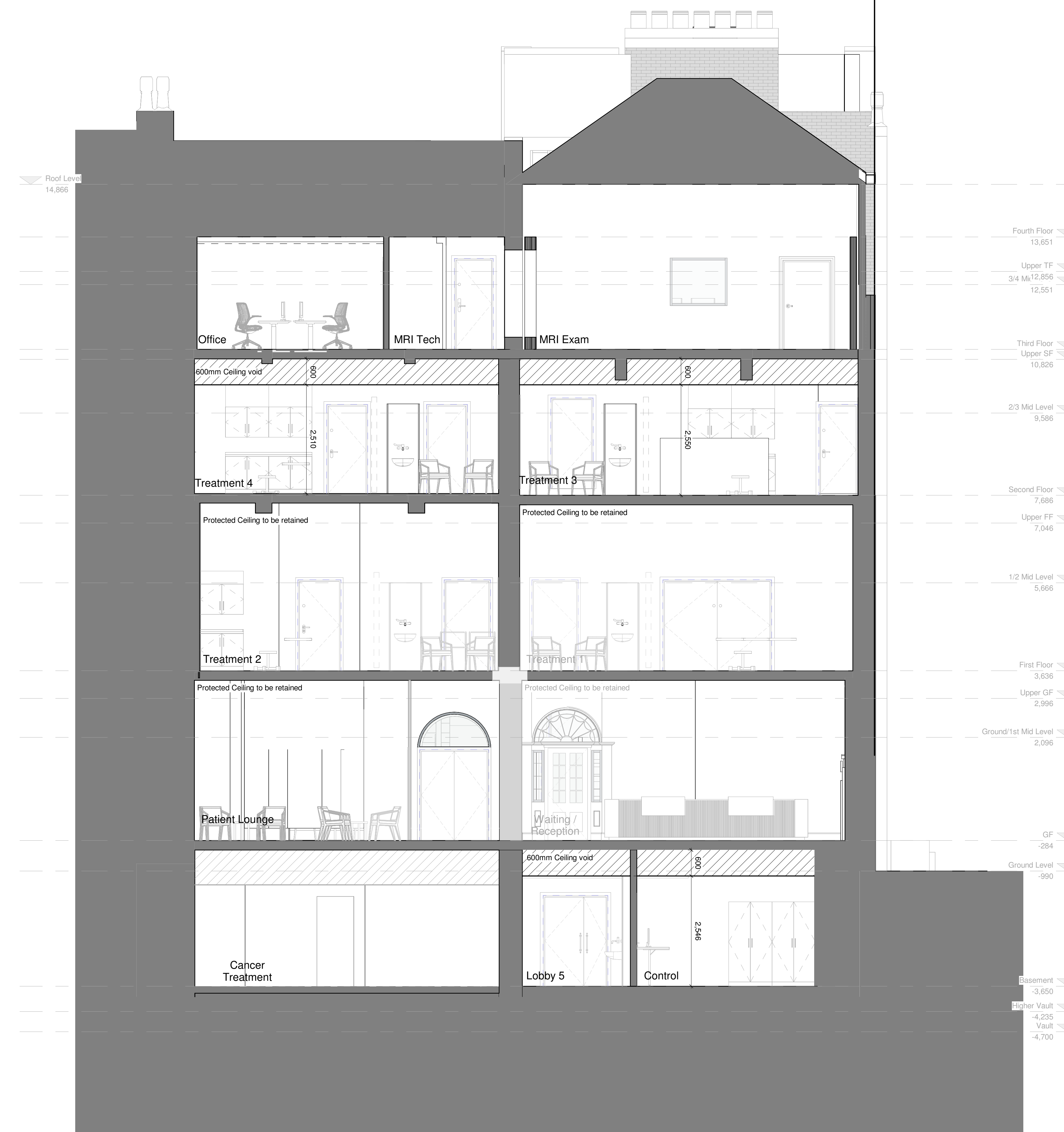
Proposed Section D - D 1 : 50