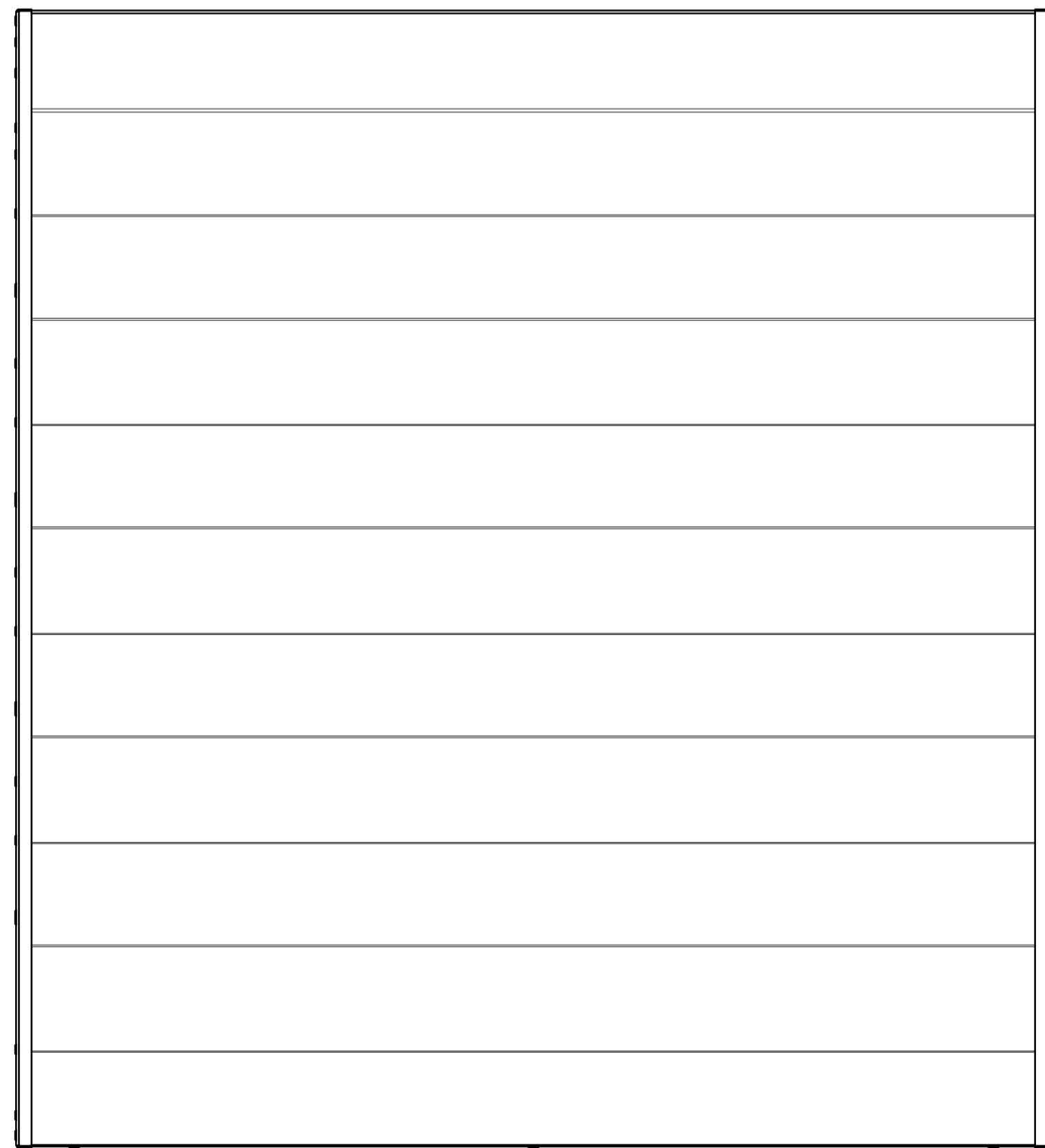
Elevation AL300: 300mm deep single layer - Rw 18dB