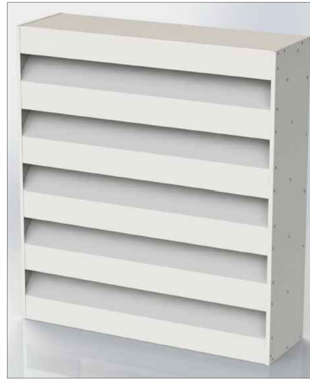
3D - AL300: 300mm deep single layer - Rw 18dB