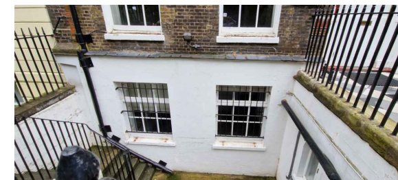
Image 1 - Basement