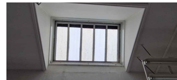
Image 2 - Roof Light