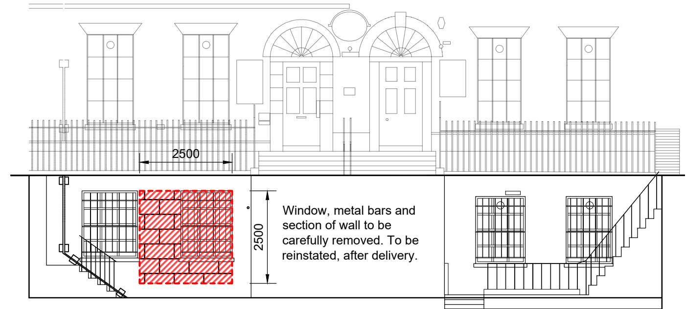
North Elevation (Basement)