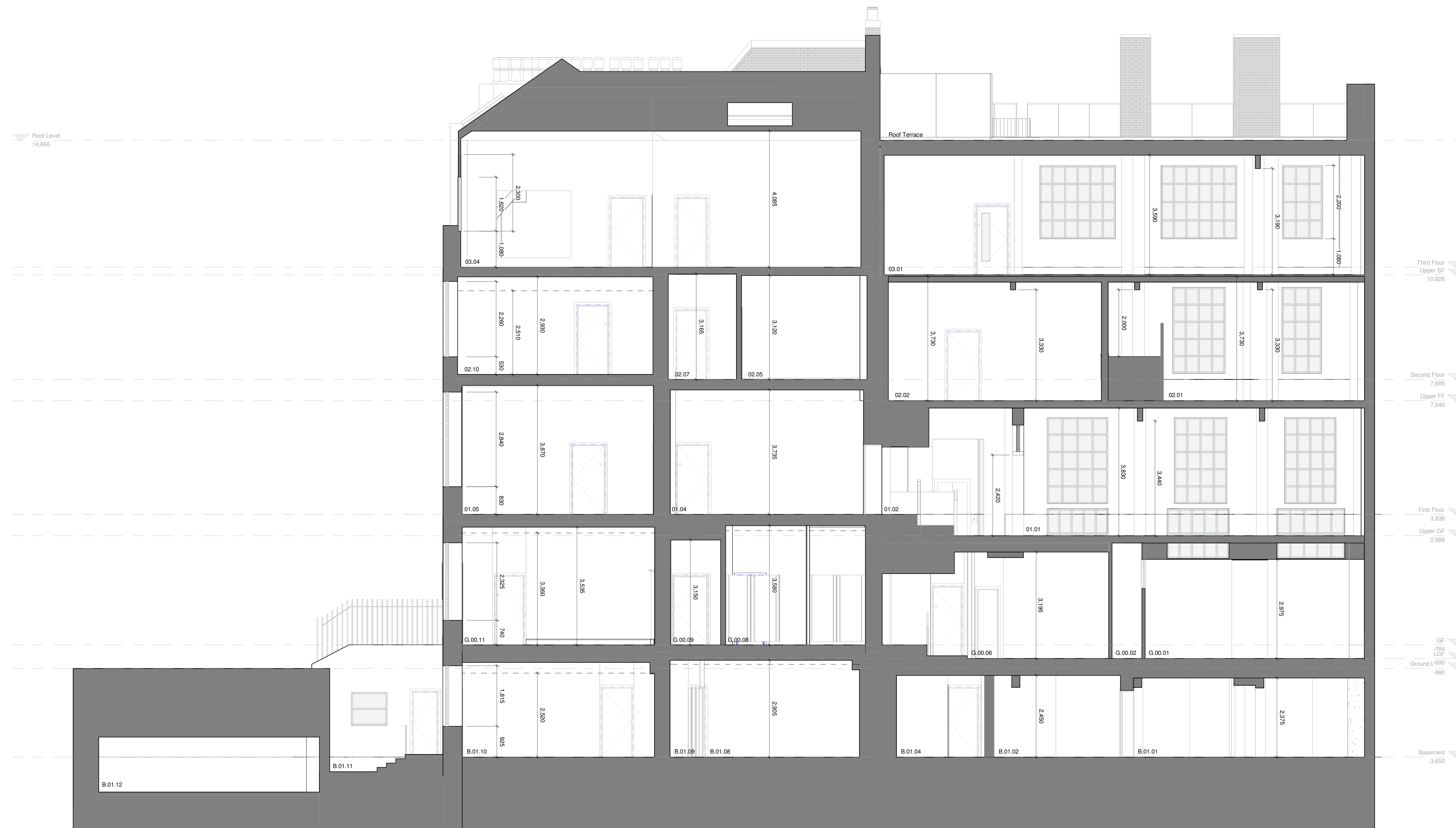
Existing Section A - A 1:50