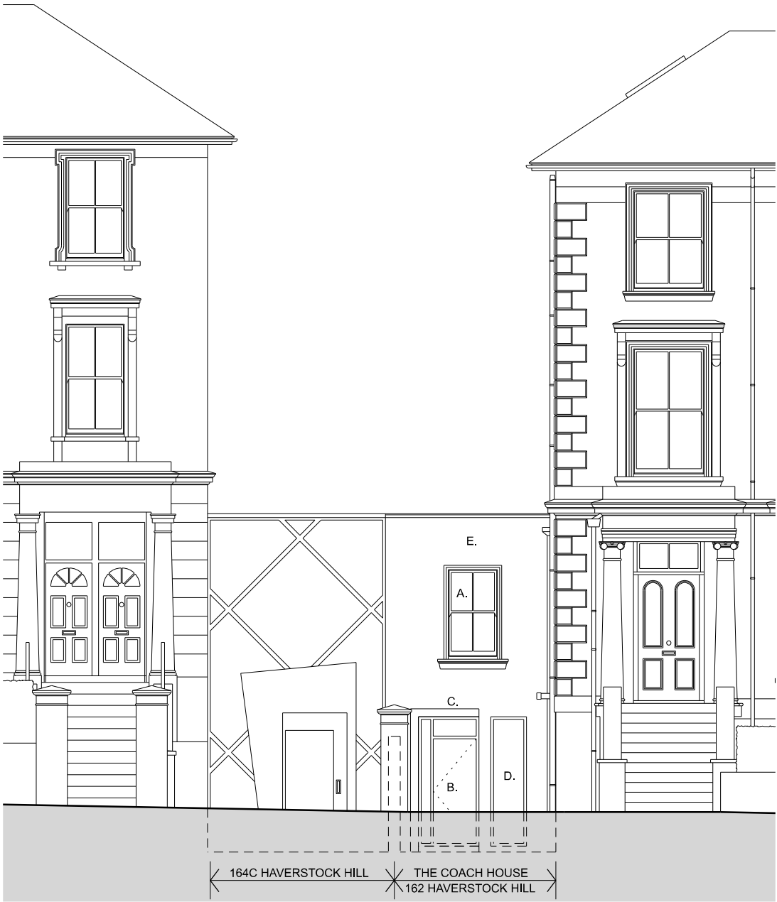
01 FRONT ELEVATION PL-007 AS PROPOSED