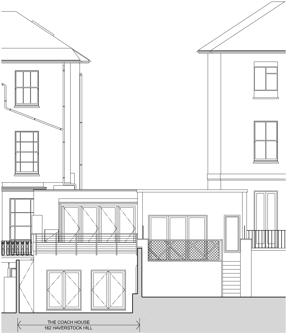
02 REAR ELEVATION PL-007 AS PROPOSED