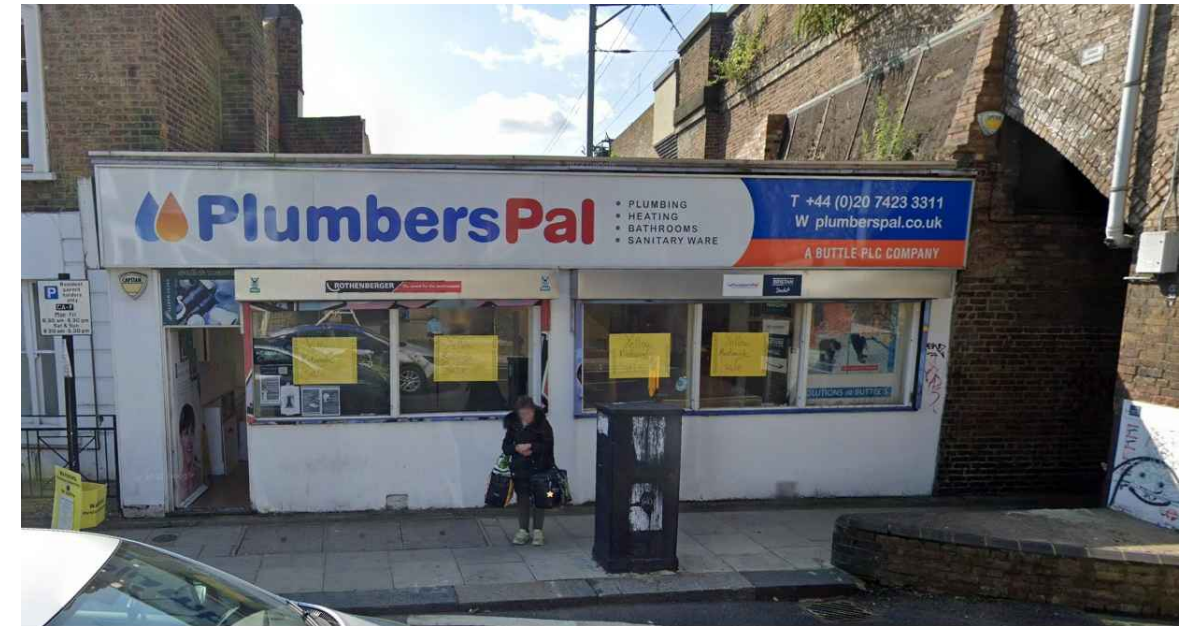
Photo of existing windows