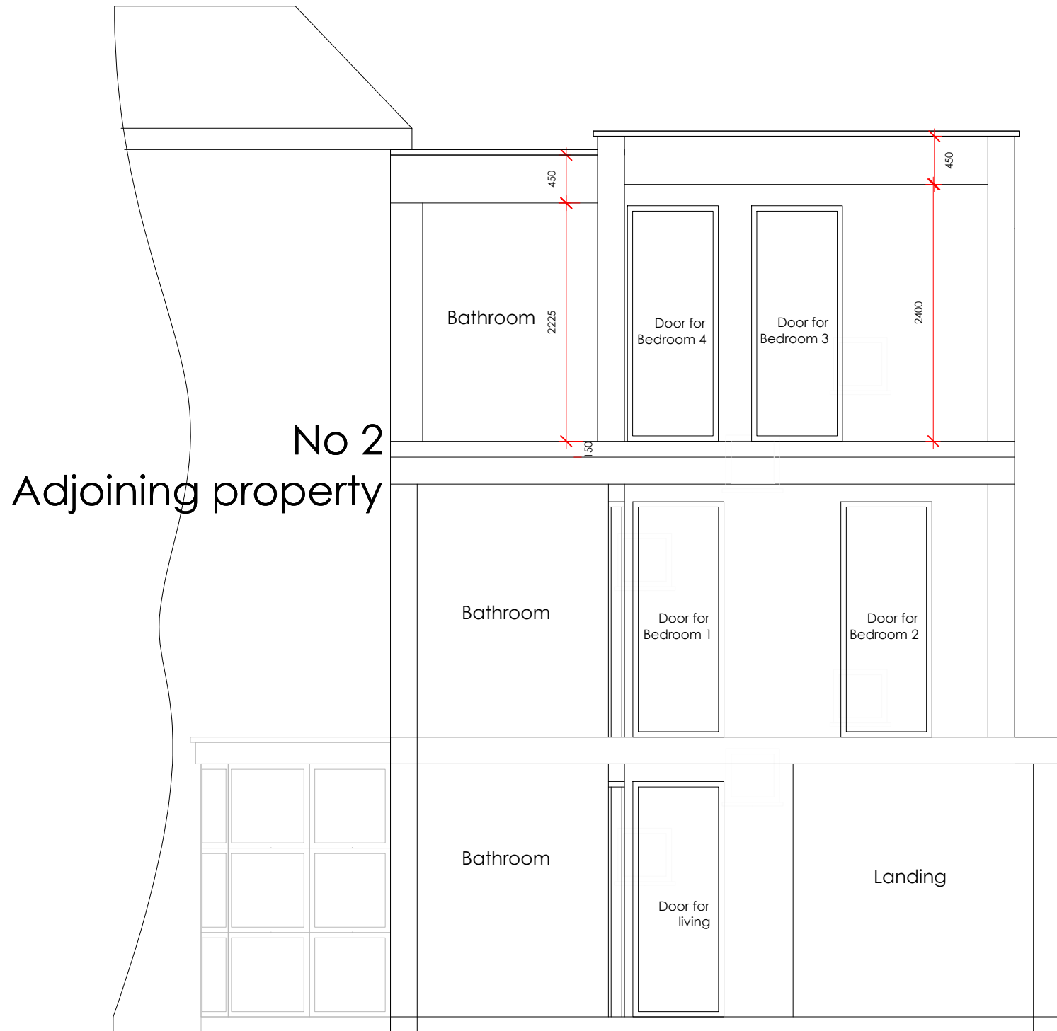
PROPOSED SIDE SECTION ELEVATION

NOTES DO NOT SCALE. WORK TO FIGURED DIMENSIONS ONLY. CONTRACTOR TO CHECK ALL DIMENSIONS. ALL ERRORS AND OMISSIONS TO BE REPORTED TO THE ARCHITECT.