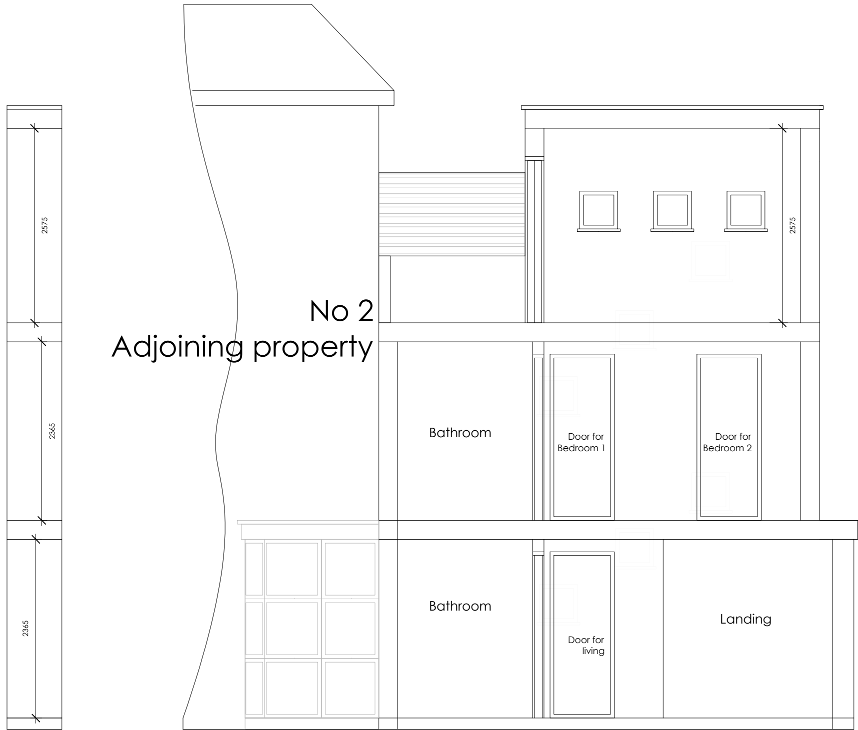
EXISTING SIDE SECTION ELEVATION