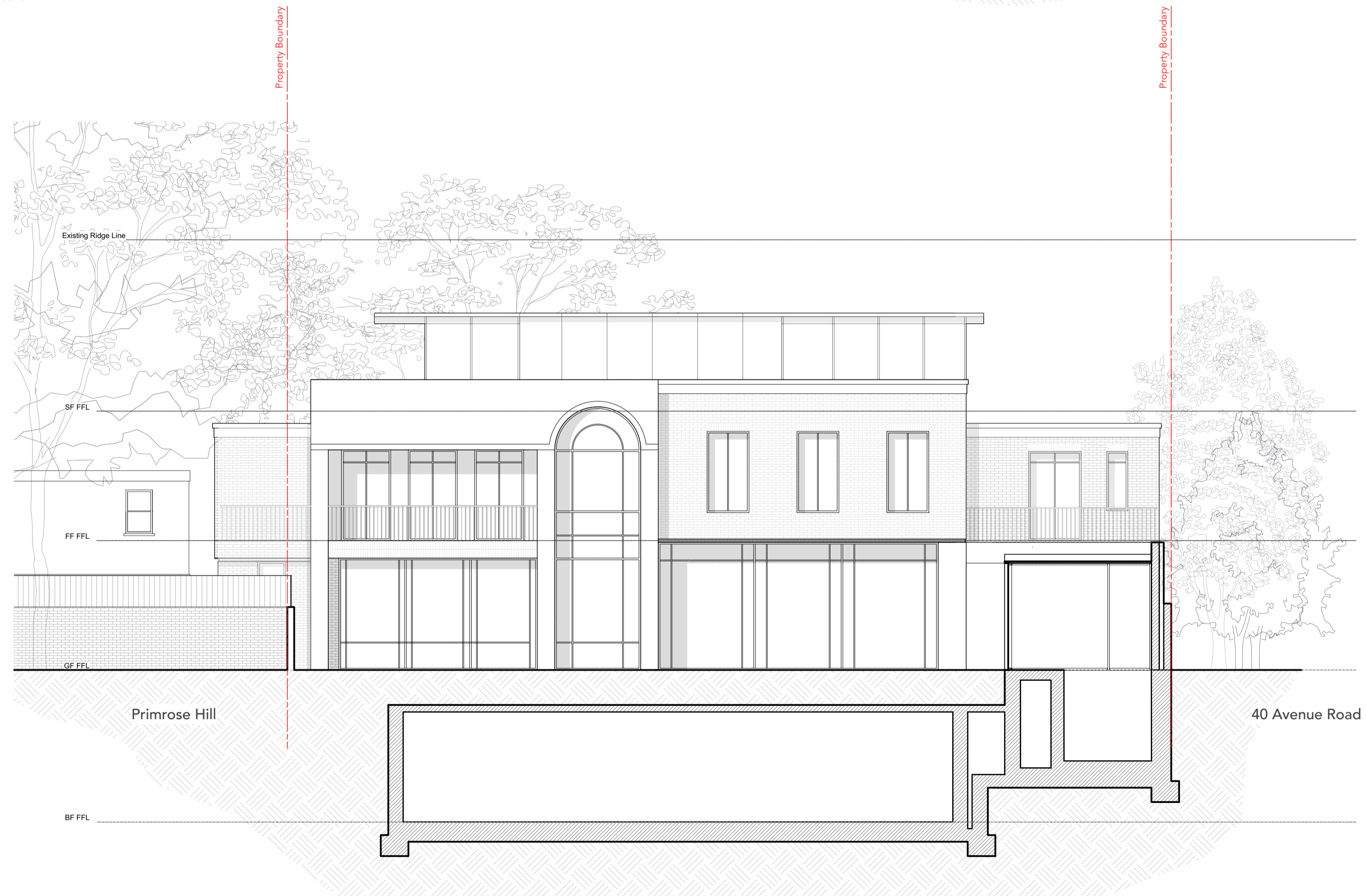
2 Proposed Section E-E Scale - 1:100@A1, 1:200@A3