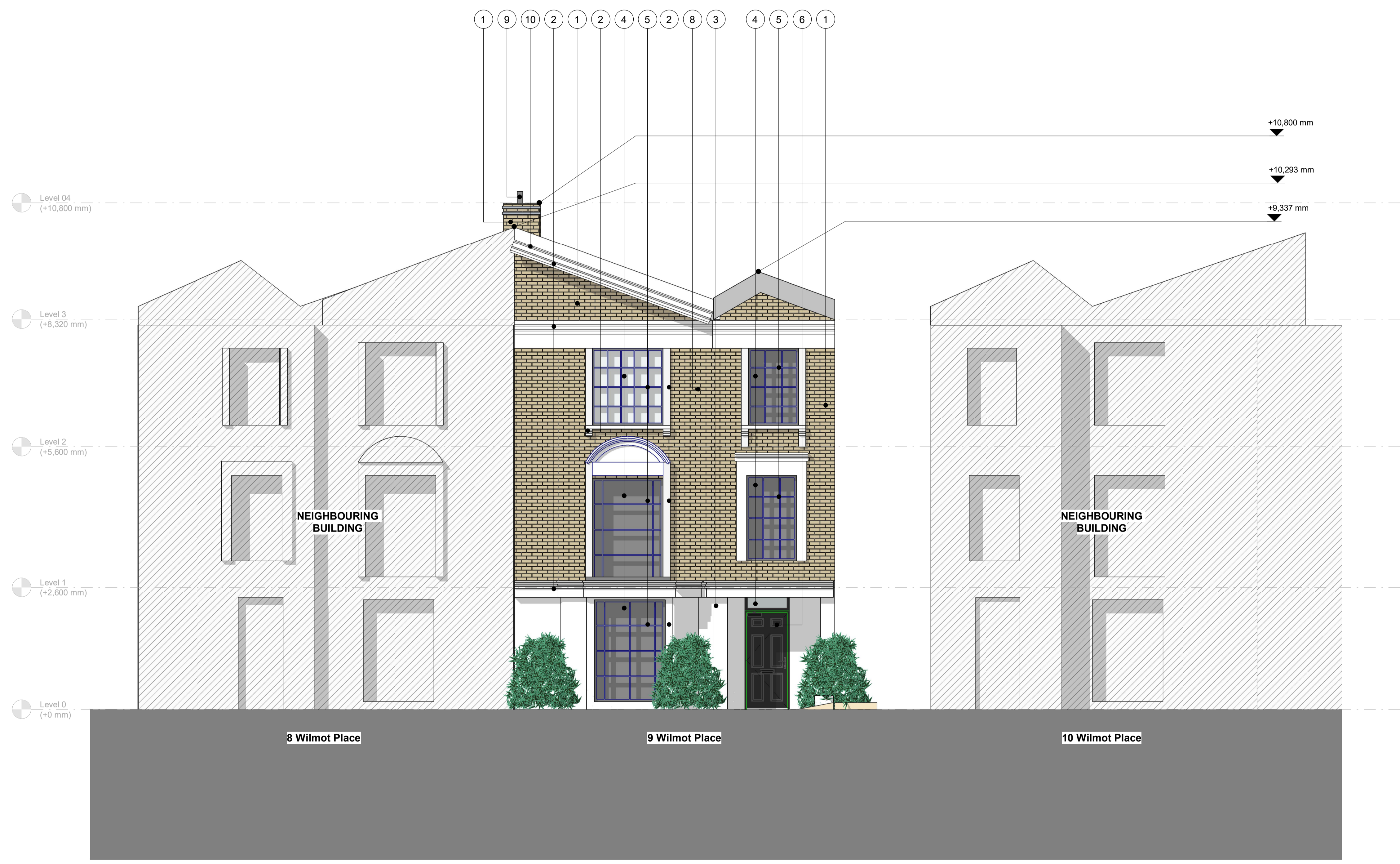
1 20251-North Elevation Existing SCALE: 1 : 50