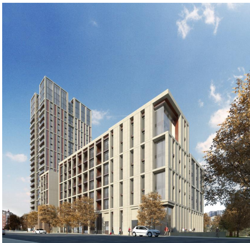
Fig. 2. CGI of approved development at 100 Avenue Road, ref. 2014/1617/P