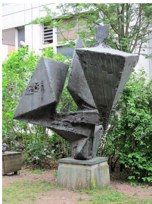
Fig. 1 Hampstead Figure Statue