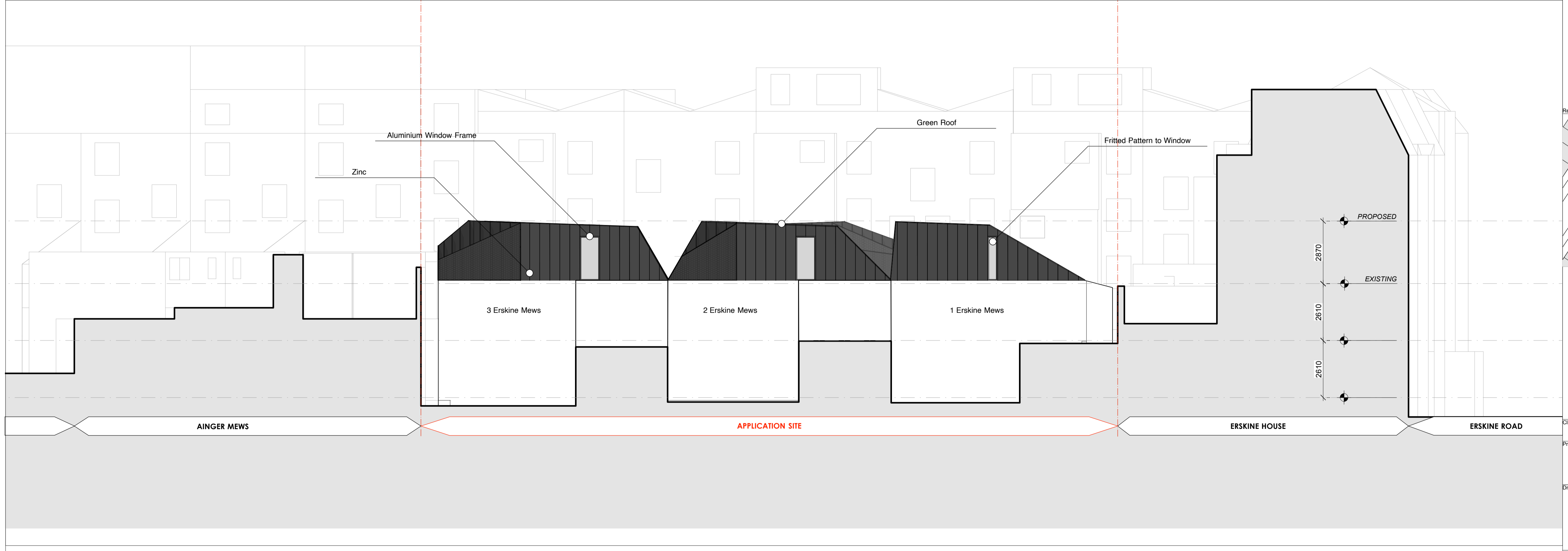
02 Proposed East Elevation 1:100 @ A1 | 1:200 @ A3