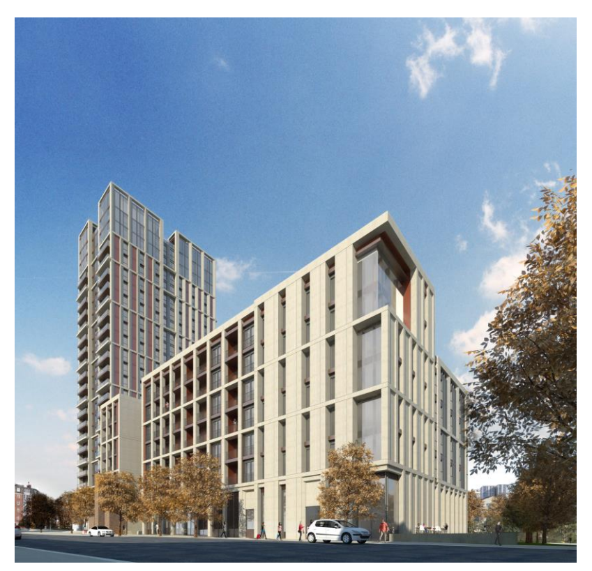
Fig. 2. CGI of approved development at 100 Avenue Road, ref. 2014/1617/P