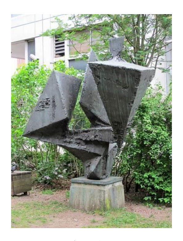
Fig. 1 Hampstead Figure Statue

2.1 The Statue is presently sited in an area of public open space off Avenue Road, in a position set back from a made public footpath and surrounded by medium level landscape planting. Its setting is dominated by the backdrop of 100 Avenue Road directly to the north, a c.1980's office building of limited design merit ranging in height between three to five commercial storeys.