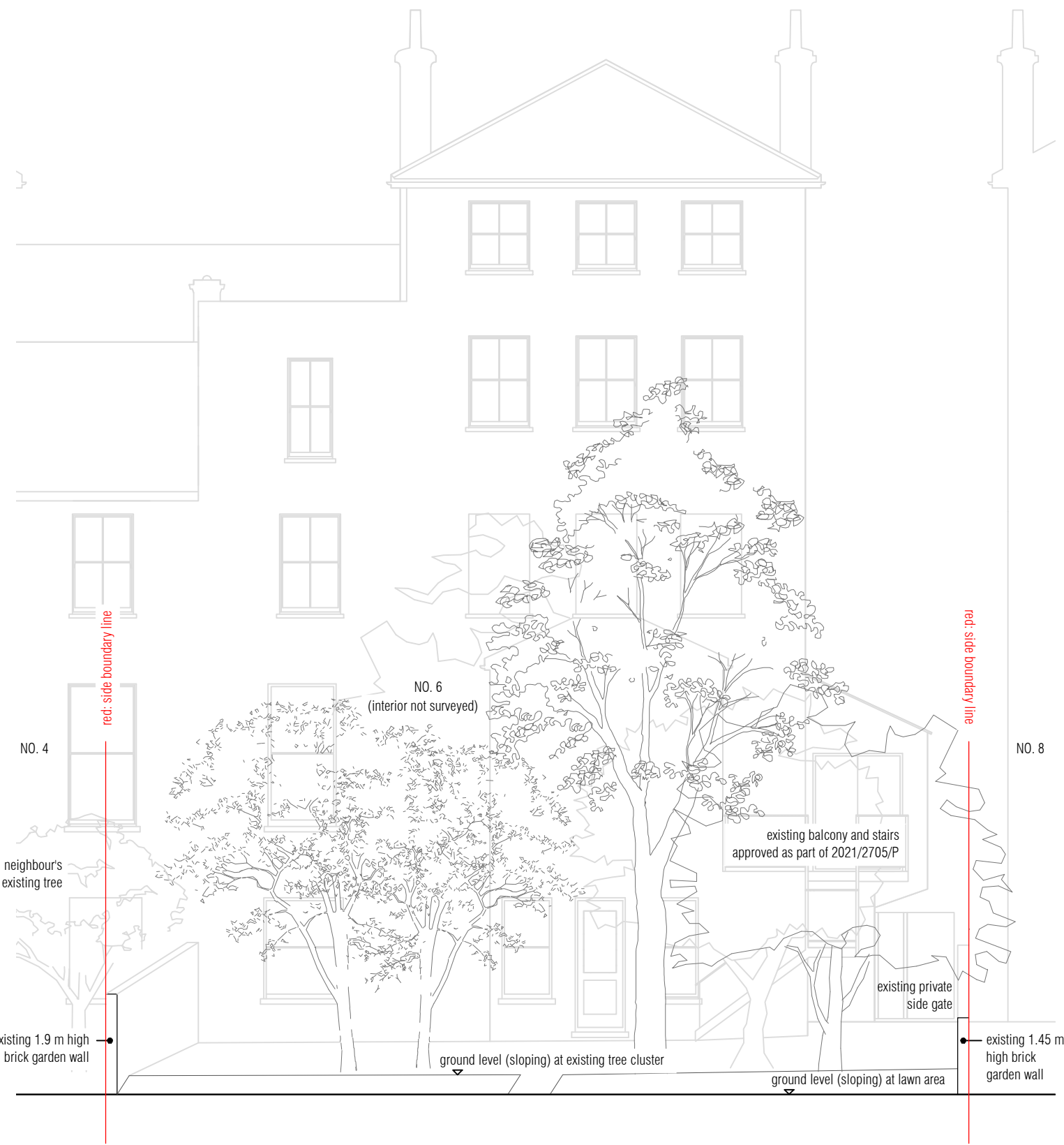
REAR GARDEN SECTION BB / ELEVATION (NORTH) - AS EXISTING (1:100)