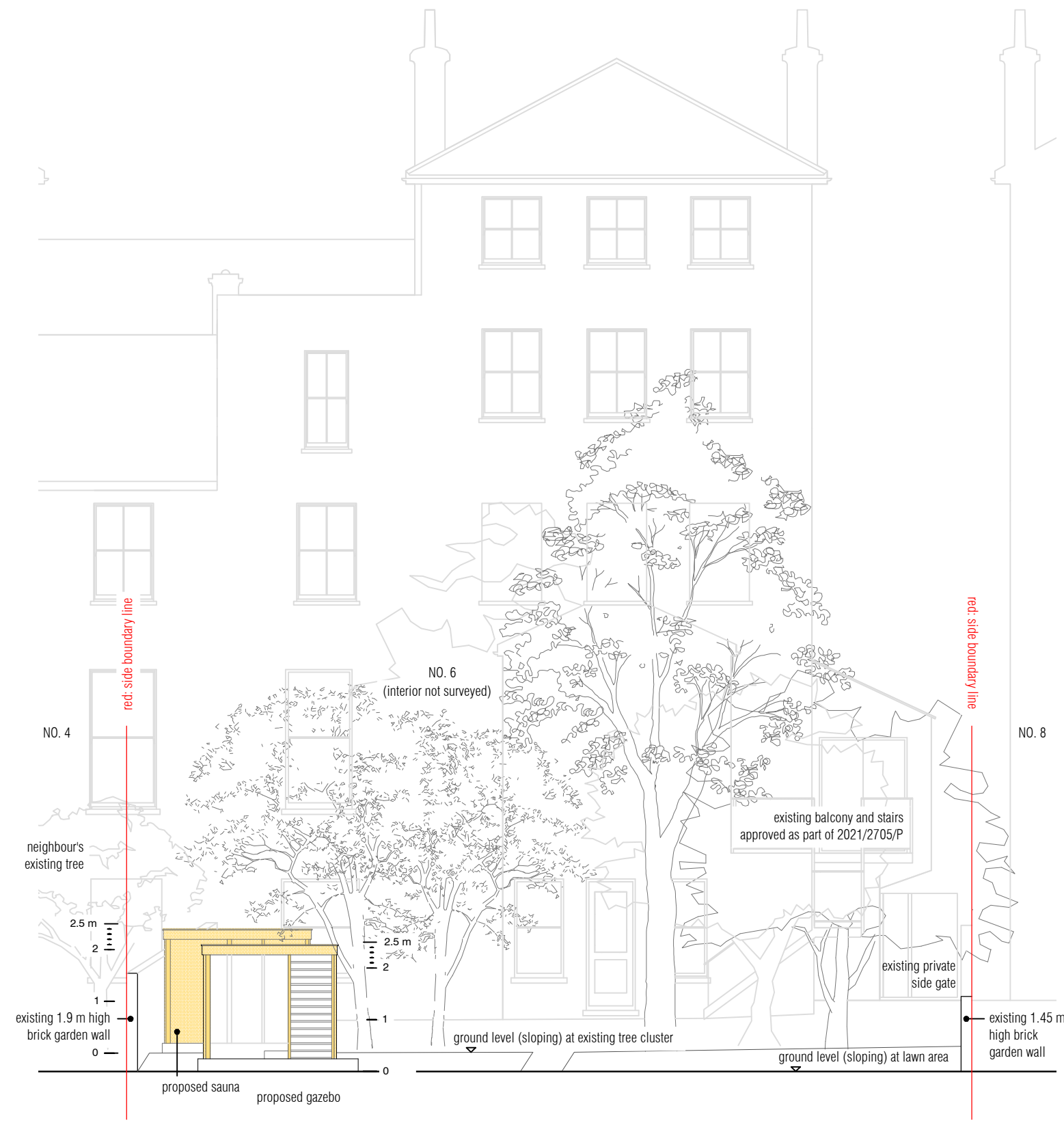
REAR GARDEN SECTION BB / ELEVATION (NORTH) - AS PROPOSED (1:100)