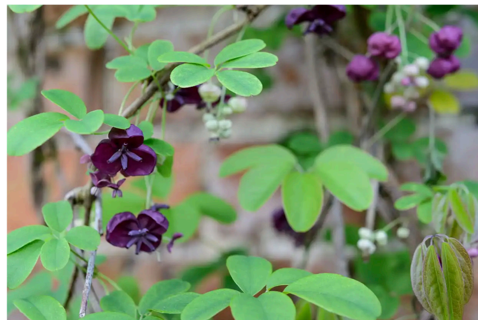
AKEBIA QUINATA PLANTED IN 5L POTS H150-200cm (SEE DRAWING 5AT_050 FOR PLANTING LOCATION) MAX SPREAD 5m