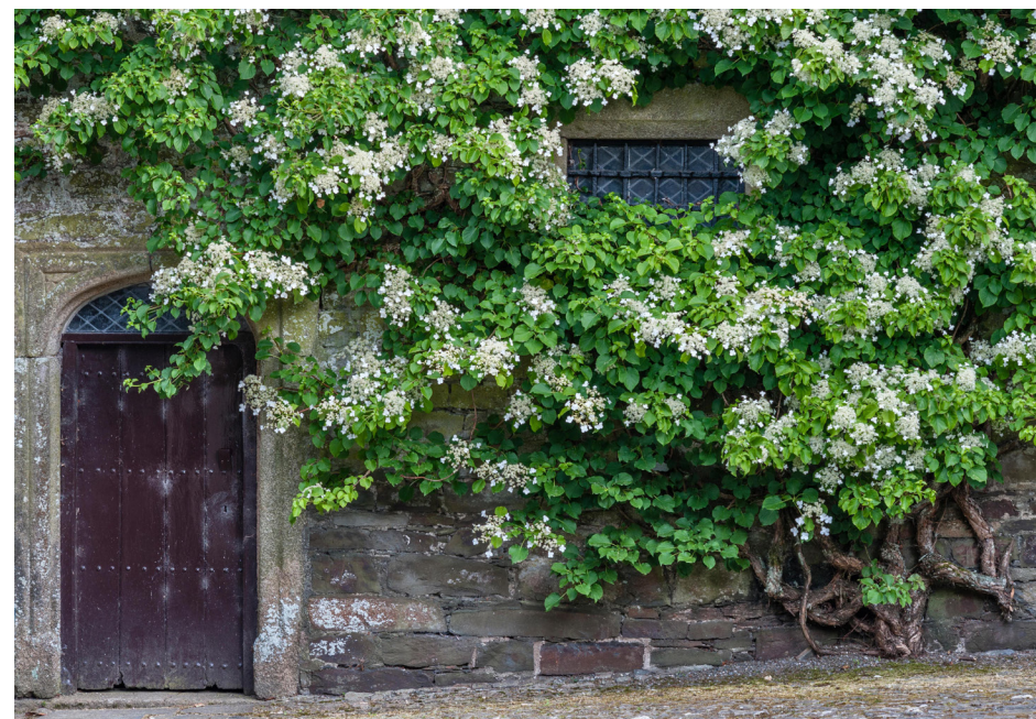
HYDRANGEA ANOMALA SUBSP. PETIOLARIS PLANTED IN 10L POT (SEE DRAWING 5AT_050 FOR PLANTING LOCATION) MAX SPREAD 6m

GENERAL NOTES WORK FROM INDICATED DIMENSIONS ONLY ALL SITE DIMENSIONS TO BE VERIFIED BY CONTRACTOR AND ANY DISCREPANCIES REPORTED BACK TO DESIGNER ALL DIMENSIONS IN MILLIMETRES UNLESS OTHERWISE STATED STRUCTURAL STABILITY OF ALL ITEMS TO BE CONFIRMED BY CONTRACTOR, DRAWINGS REPRESENT DESIGN INTENT ONLY ALL WORK TO CONFORM TO BRITISH STANDARDS AND ANY REQUIRED PLANNING REGULATIONS TO BE READ IN CONJUNCTION WITH LAYOUT, SETTING OUT PLAN AND ADDITIONAL CONSTRUCTION DETAILS ALL DESIGNS SUBJECT TO COPYRIGHT