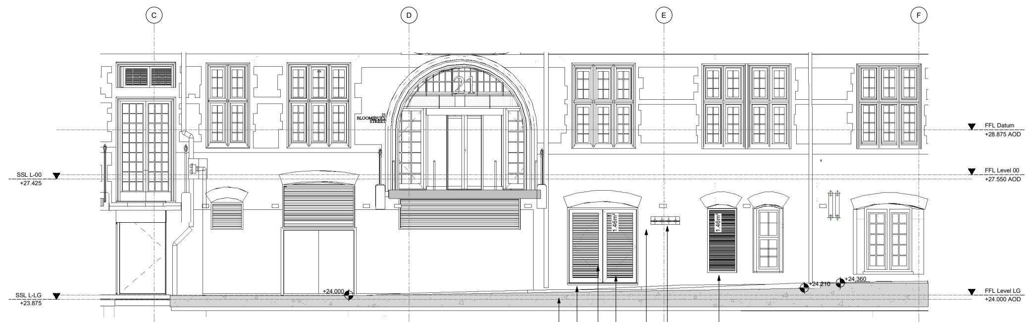
2 Bloomsbury Street - Elevation Extract - Proposed -PL 1 1:50