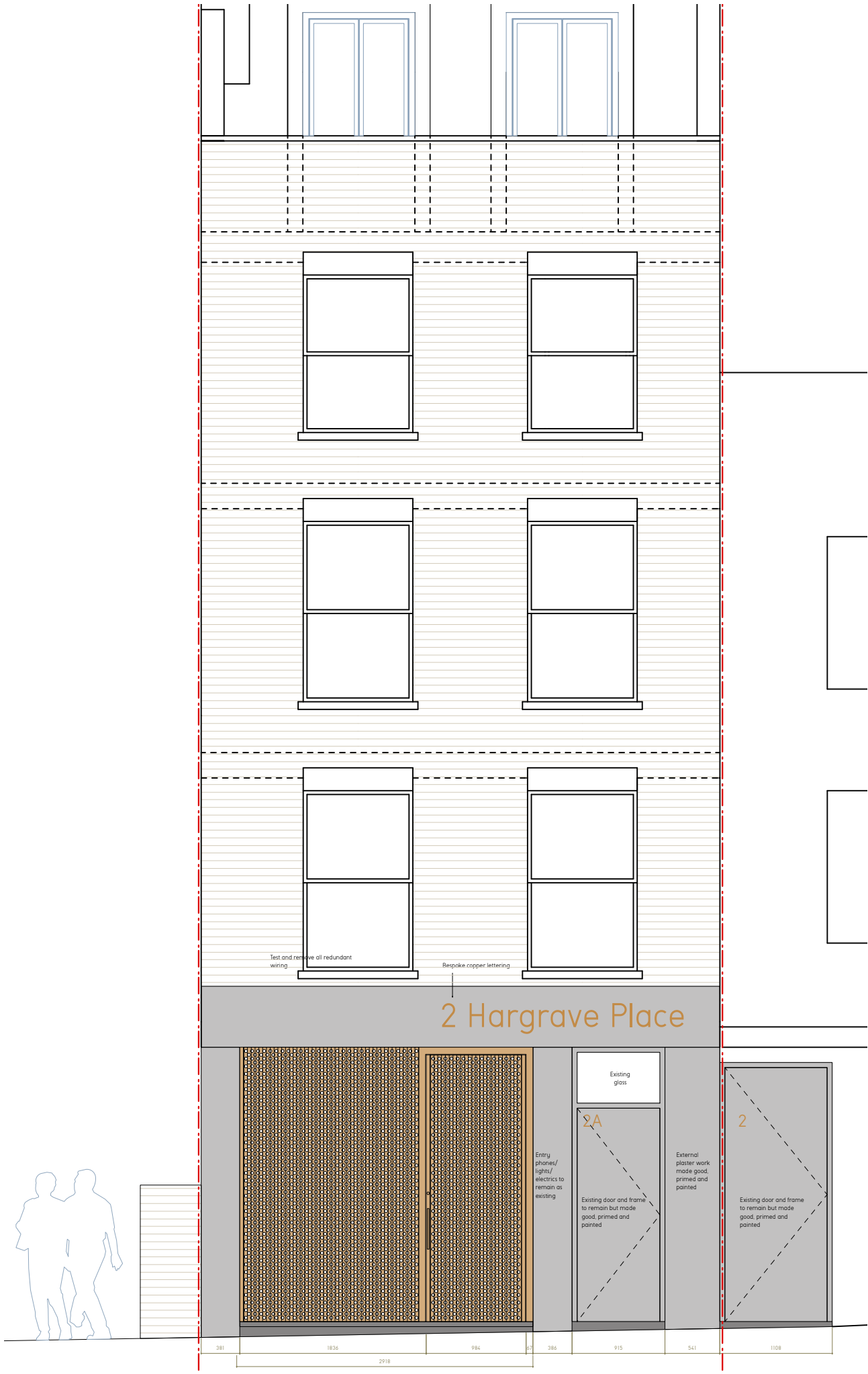
1 Proposed South Elevation onto Hargrave Place

Scale 1:50 Date 24.04 Drawing Number 130 -