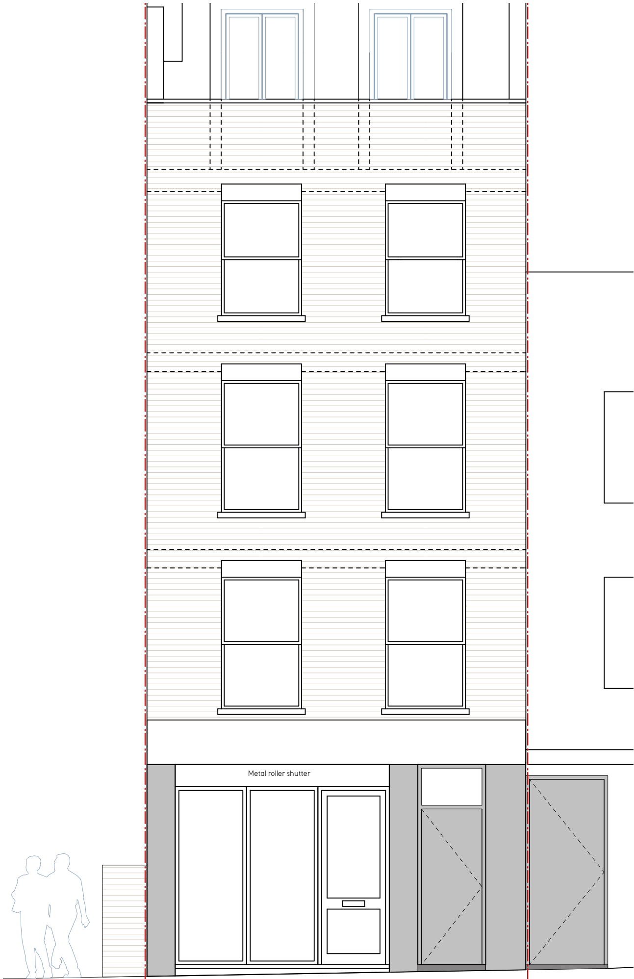
1 Existing South Elevation onto Hargrave Place

Scale 1:50 Date 24.04 Drawing Number 030 -