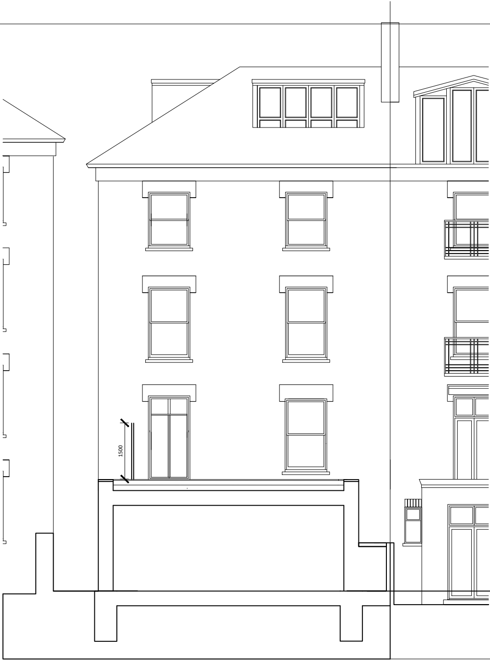
Proposed A-A Section