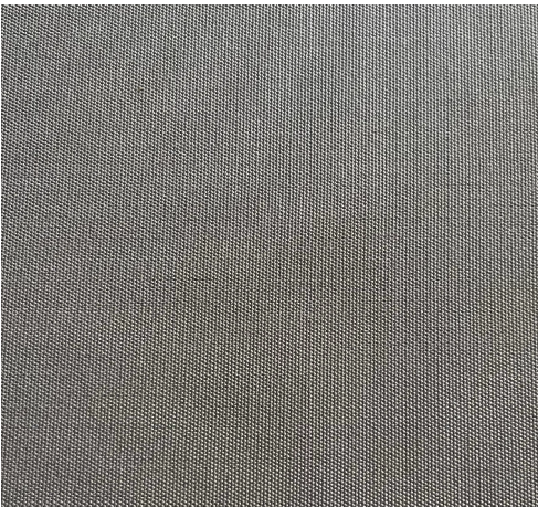
Retractable cover material in Grigio