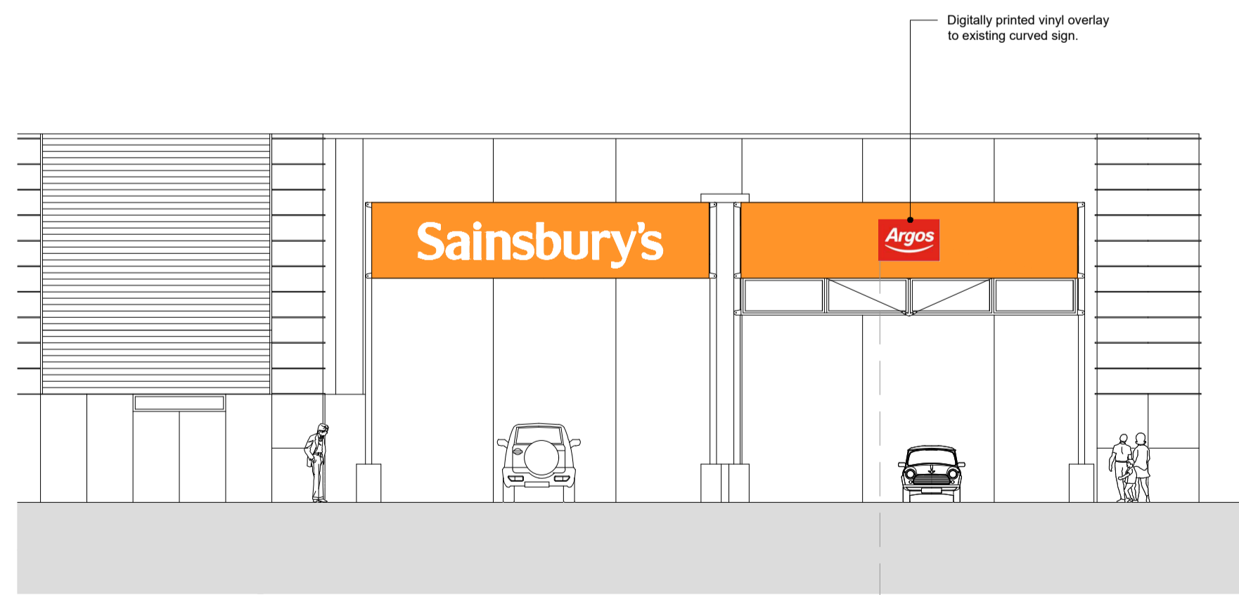
Proposed North West Elevation Scale 1:125 @ A1