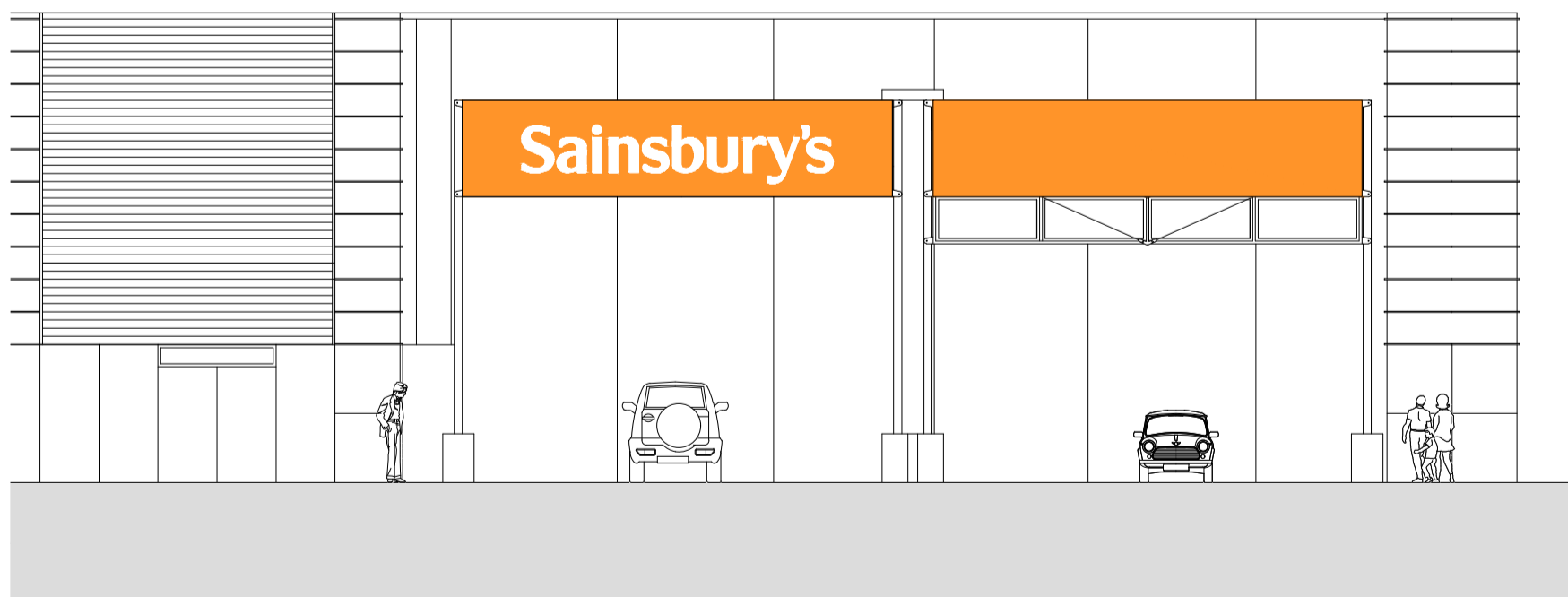
Existing North West Elevation Scale 1:125 @ A1