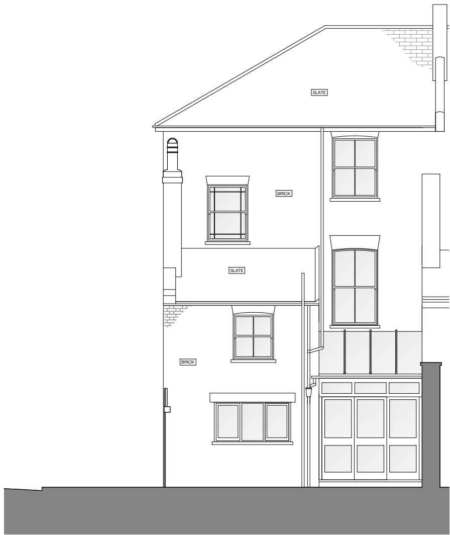
NORTH-WEST (REAR) ELEVATION AS EXISTING