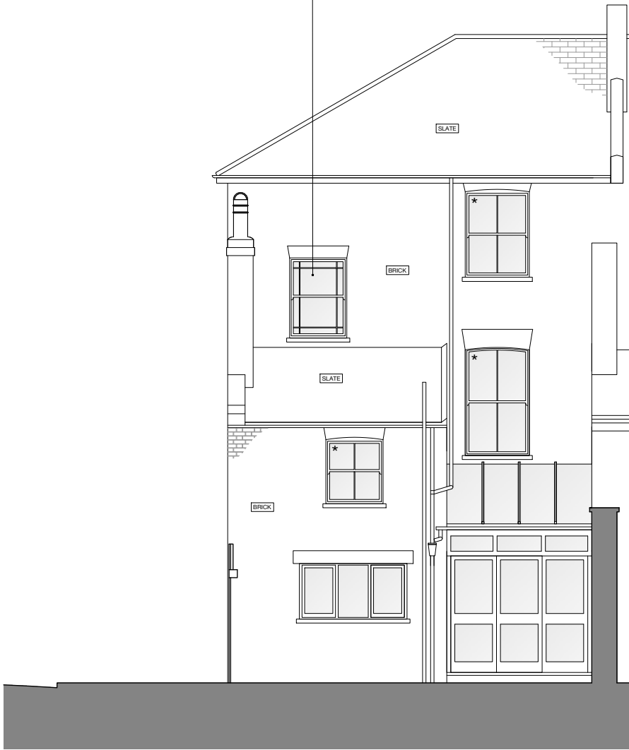
NORTH-WEST (REAR) ELEVATION AS PROPOSED

NEW WHITE PAINTED TIMBER FRAMED WINDOW TO MATCH EXISTING ARRANGEMENT (FANLIGHT ABOVE FIXED PANEL). GLAZED WITH 4,16,4 DOUBLE GLAZED UNIT