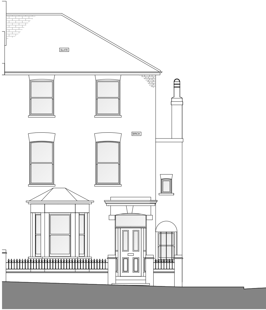
SOUTH-EAST (FRONT) ELEVATION AS EXISTING