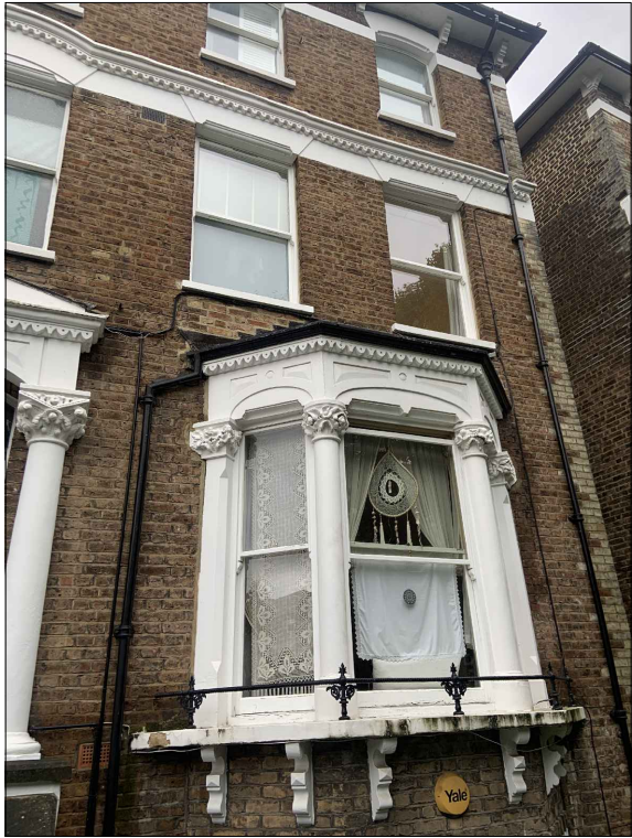
EXISTING PHOTO - FRONT BAY WINDOW (WUG.01 - WUG.03)