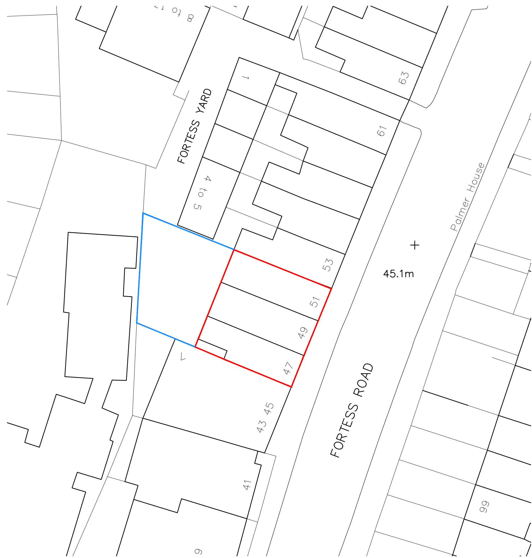
02 SITE BLOCK PLAN 1:500