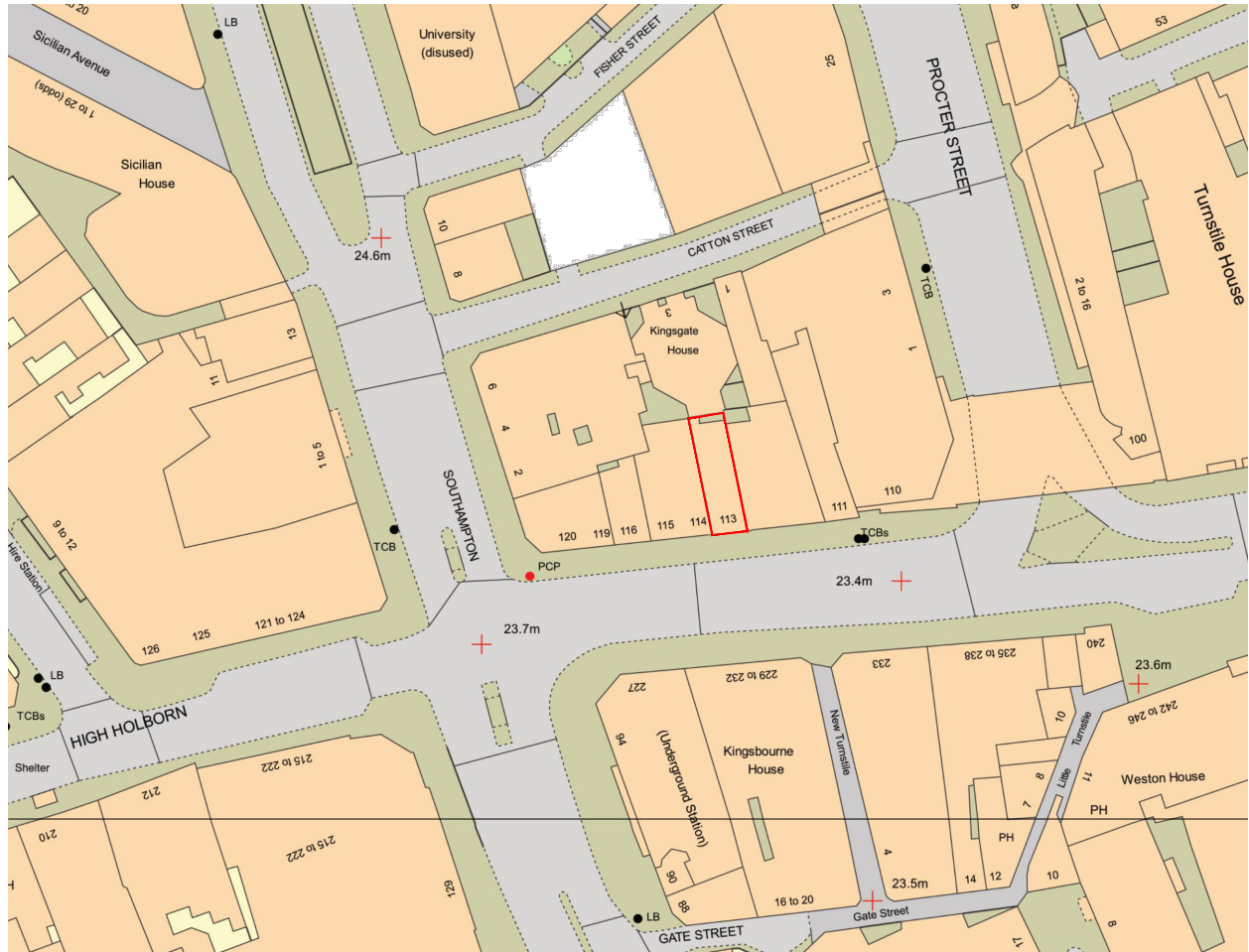
03 - OS MAP SCALE 1:1250