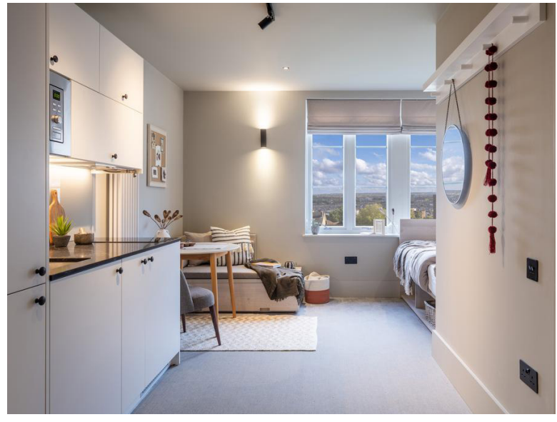
Holm Wimbledon Park