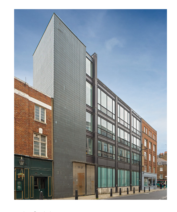
Whitfield Street - Virgin HQ