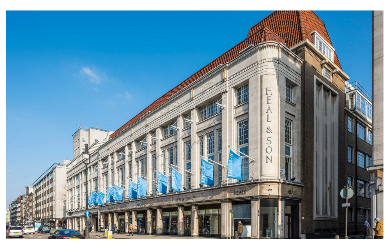
Heal & Son Tottenham Court Road