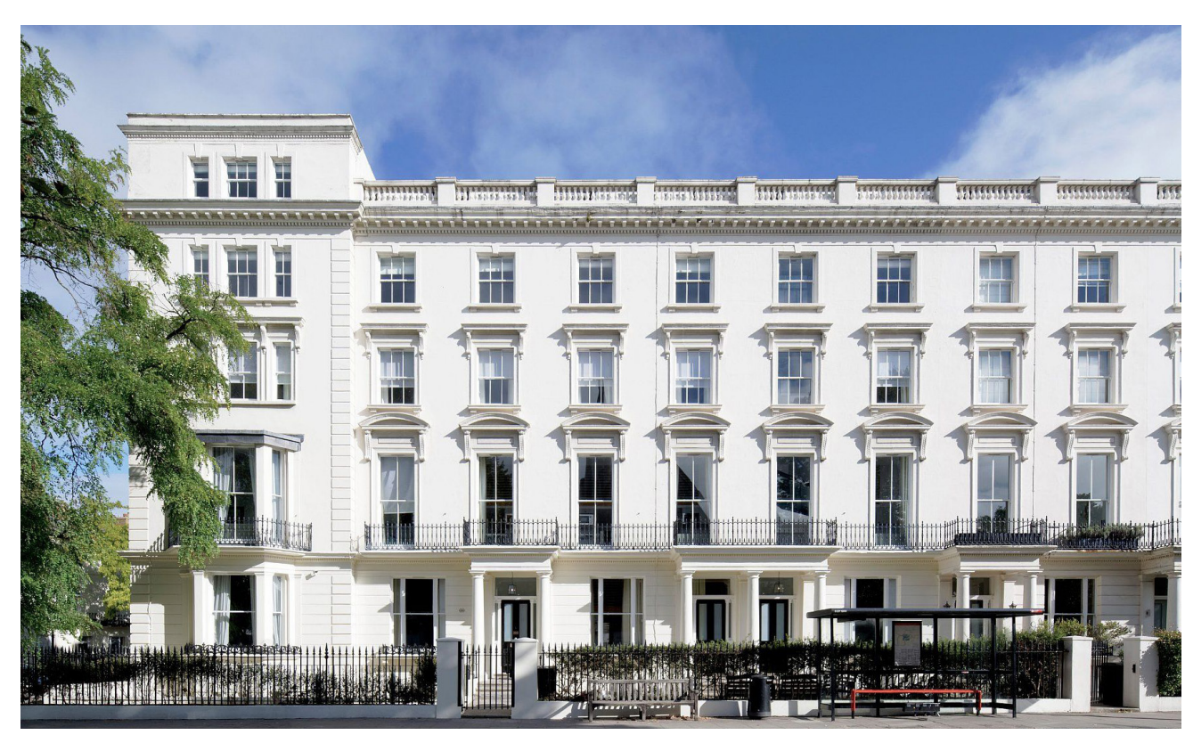
Vernon House - Primrose Hill