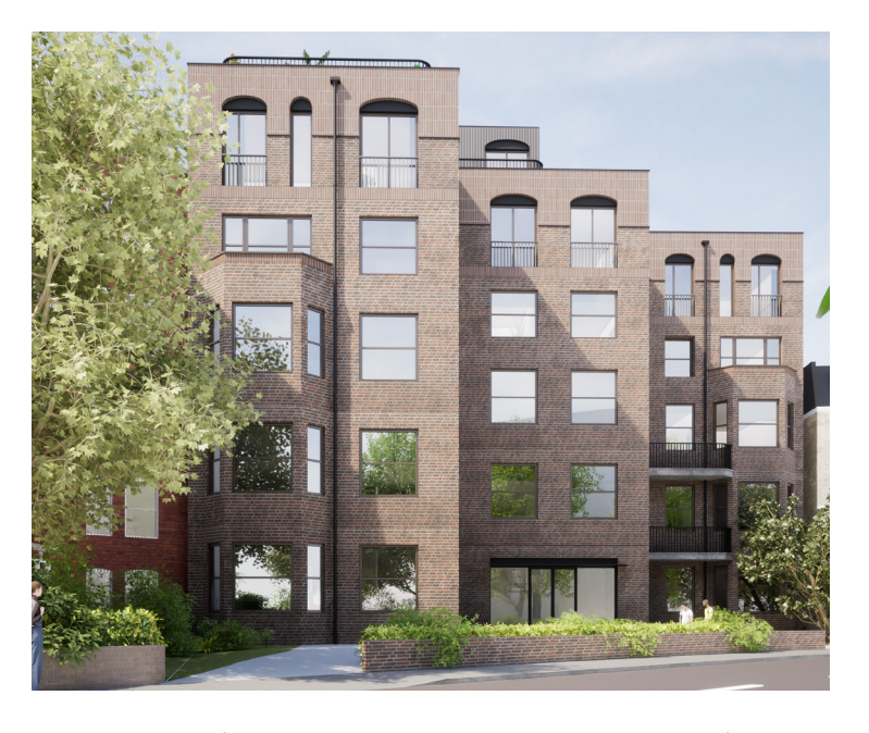
Francis Gardner Apartments West Hampstead