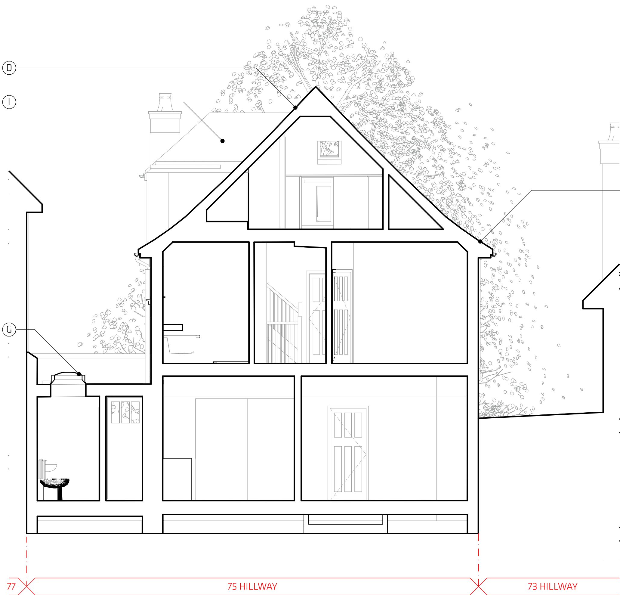
01 Existing Section AA Scale @ A1: 1:50