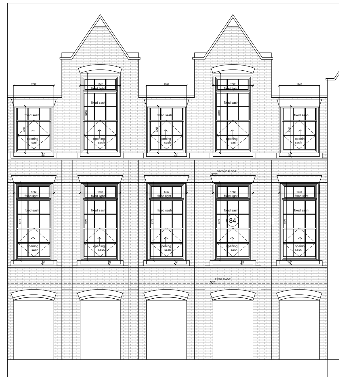
Existing South West Elevation

rotten cill replaced in new oak profile to match original