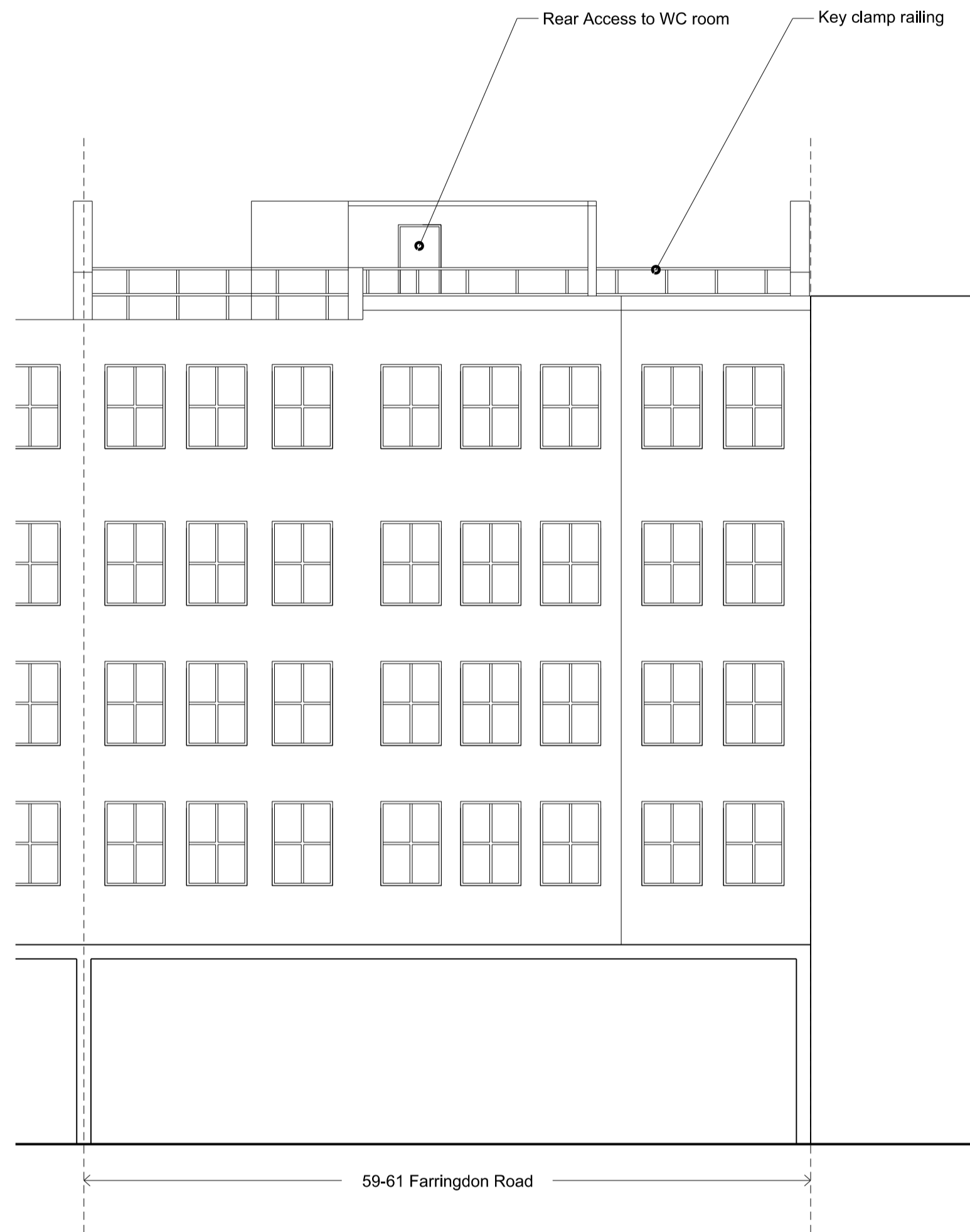
0 | EXISTING REAR ELEVATION 1:100 @ A1 ZEP-ANO-F0-EL-DR-A-01 I EL

Drawing number ZEP-ANO-F0-EL-DR-A-EL S1 P02