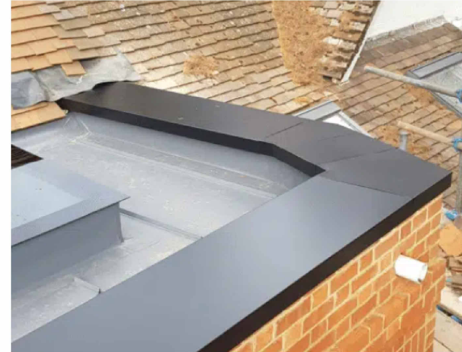
Powder coated aluminium coping 300 x 60 mm https://kladworx.com/products-and-services/aluminium-coping/