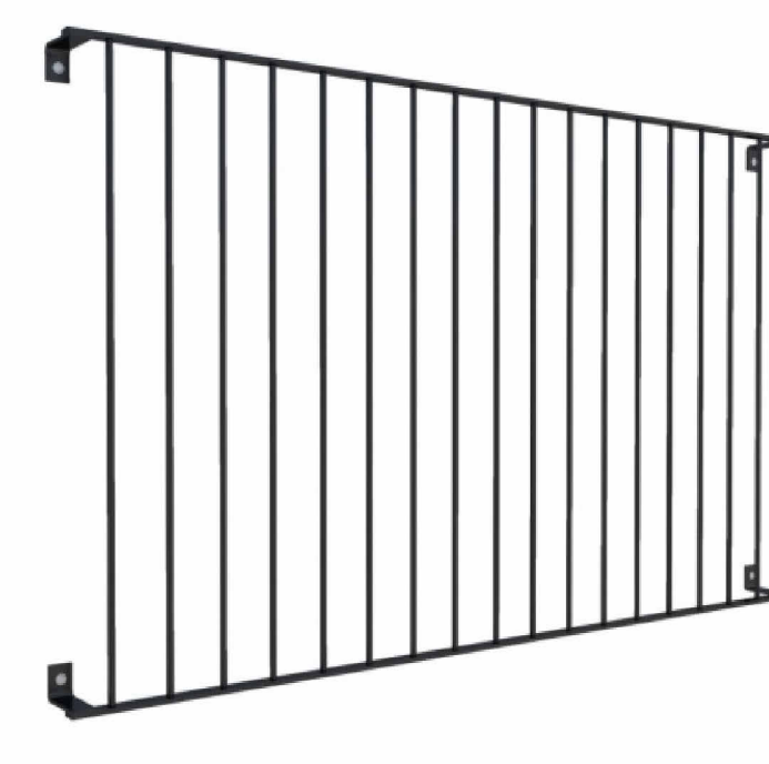
Juliet Balcony - anthracite grey finish 1925 x 1100 mm https://www.ironoctopus.co.uk/wharfedaleJulietBalcony.html