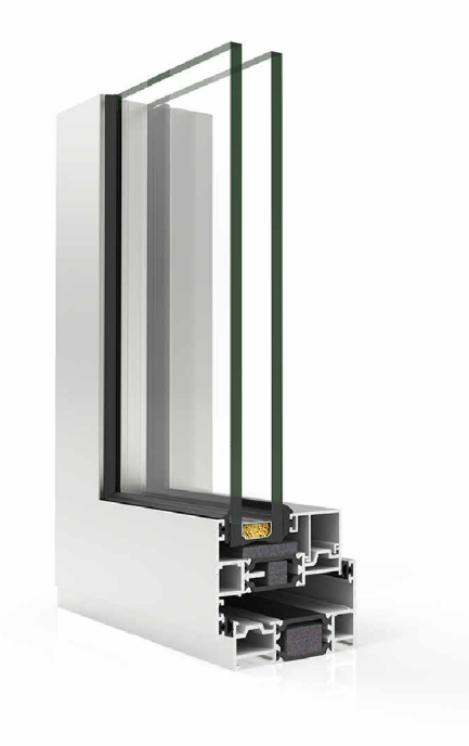
Powder coated aluminium windows - Cortizo Casement TB - Slim Smash Sizes as approved https://www.cortizo.com/en/sistemas/ver/130/casement-tb.html