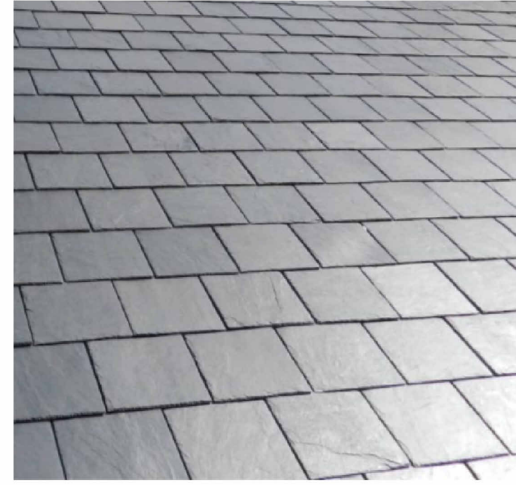
Natural grey slate tiles - Del Prado 500 x 250 mm https://www.ssqgroup.com/products/del-prado