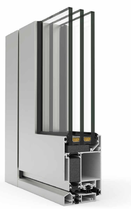
Powder coated aluminium hinged doors - Cortizo Millennium Plus 70 Sizes as approved https://www.cortizo.com/en/sistemas/er/54/millennium-plus-70-door.html

Bricks slips - Same brick model cut by manufacturer's brick cutter