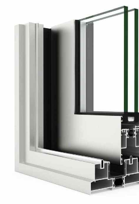
Powder coated aluminium sliding doors - Cortizo 4700 Sliding Sizes as approved https://www.cortizo.com/en/sistemas/as/ver/92/4700-sliding.html